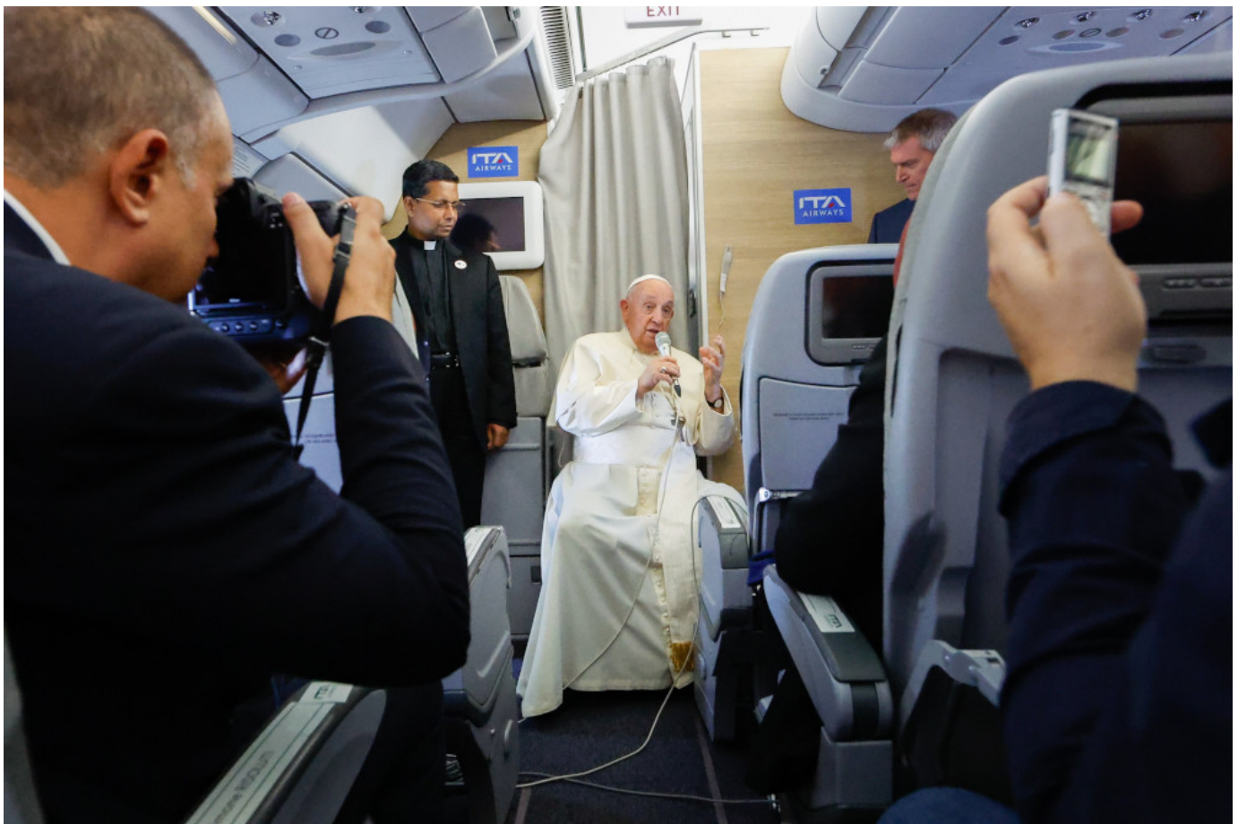
Pope Francis answers questions from journalists aboard his flight back to Rome from Ulaanbaatar, Mongolia, Sept. 4, 2023.

"Detaching from the journey of communion is ideology," the pope warned.