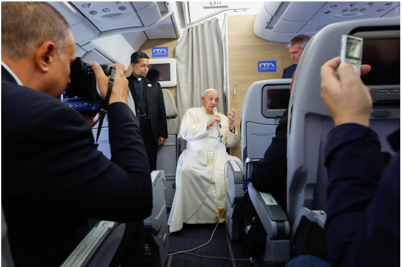
Pope Francis answers questions from journalists aboard his flight back to Rome from Ulaanbaatar, Mongolia, Sept. 4, 2023.

"Detaching from the journey of communion is ideology," the pope warned.