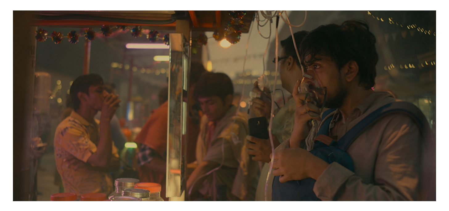
Adarsh Gourav in "Extrapolations"

Through intimate stories driven by personal relationships, Fortenberry said, " 'Extrapolations' was an attempt to try to capture in a TV show: What are the changes that come from staying the same?"