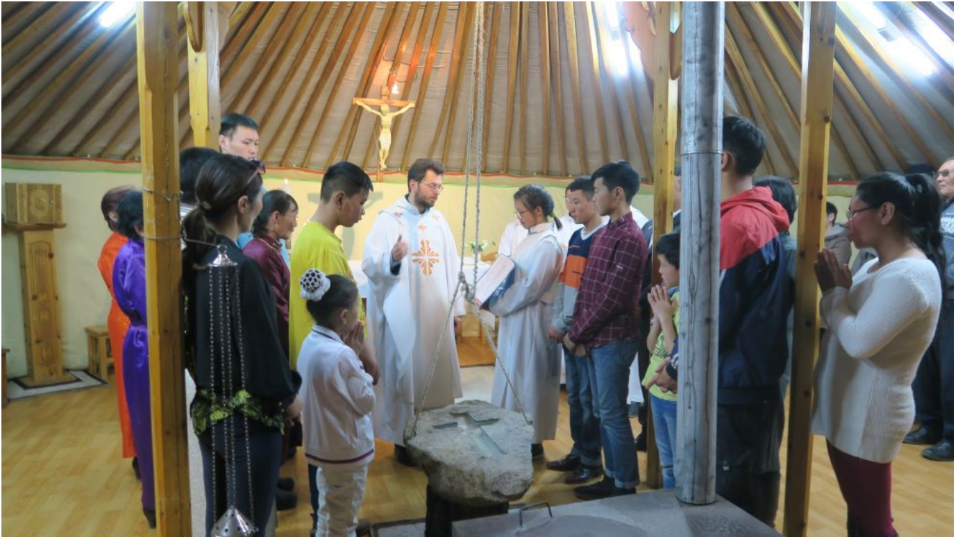
Cardinal Giorgio Marengo, apostolic prefect of Ulaanbaatar, Mongolia, center, is pictured celebrating Mass in a March 31, 2018, file photo. Mongolia's Catholic community is one of the world's smallest.