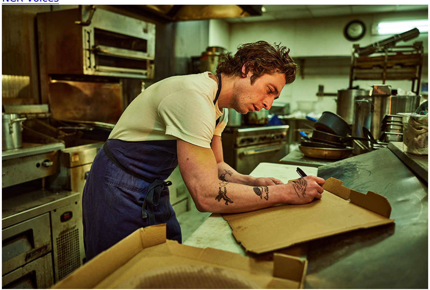
Jeremy Allen White in Season 2 of "The Bear"