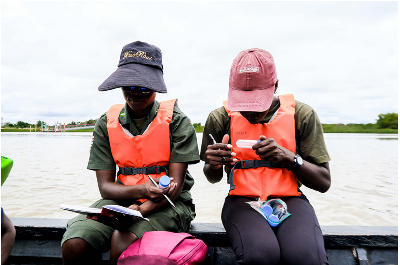
Agbetsi Living Water Swim expedition crew members note down sampling data.

The swim expedition, which concluded on May 16, broke numerous milestones as the longest swim in Ghanaian history and employed the first solar-powered research vessel in Ghana.