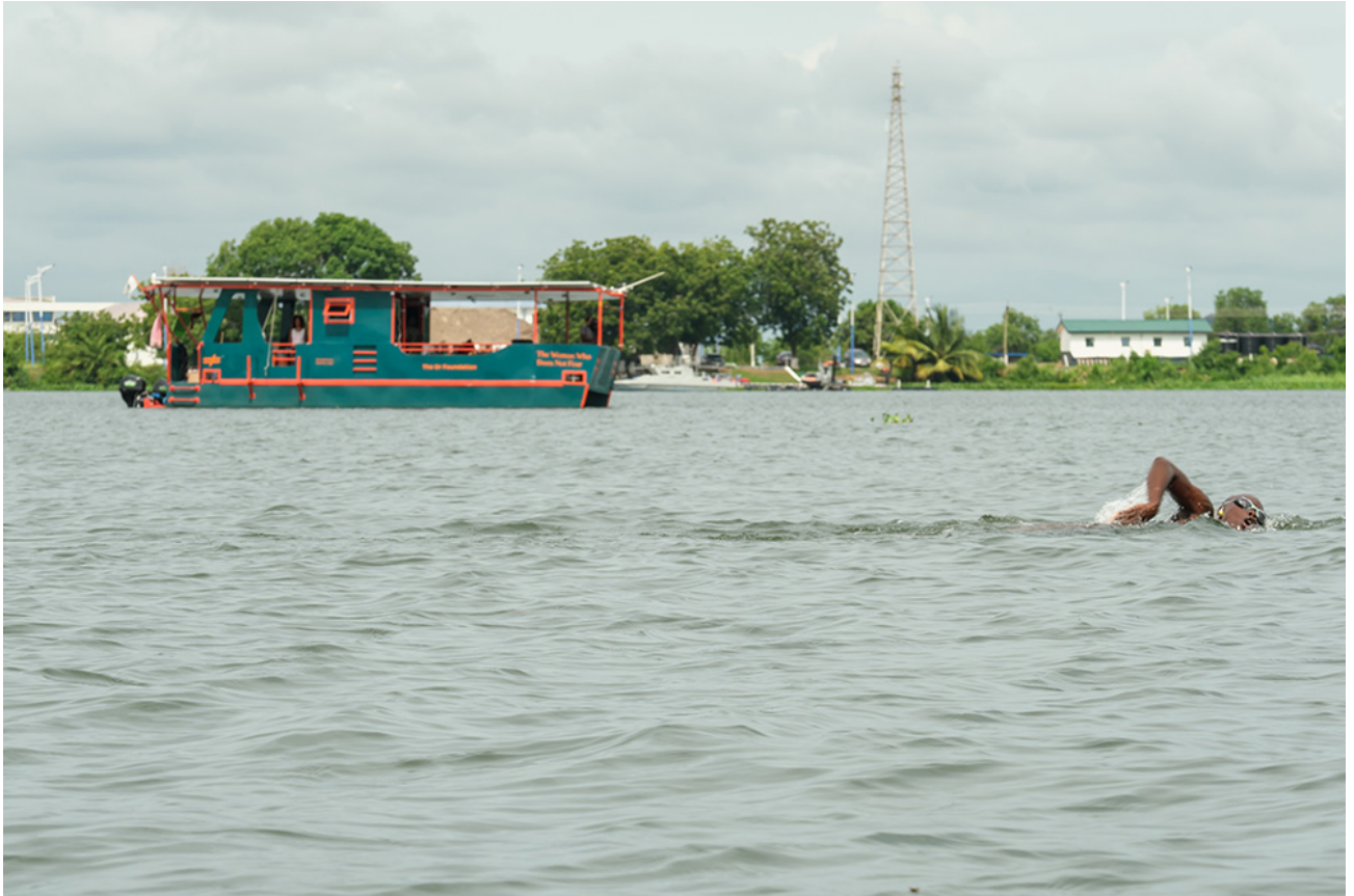
Yvette Tetteh swims along the Volta River, while the solar-powered research vessel "The Woman Who Does Not Fear" follows.