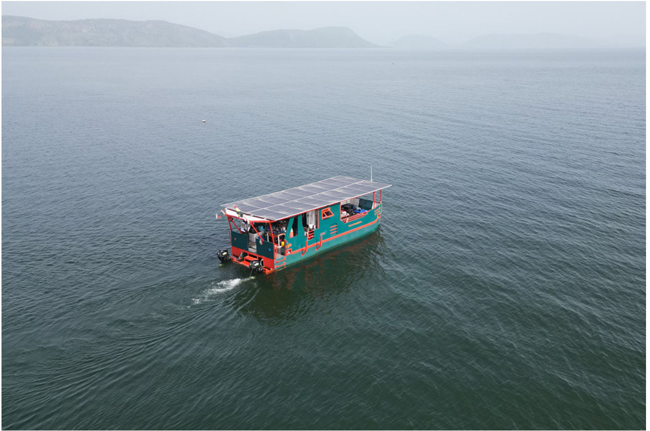
"The Woman Who Does Not Fear" travels on the Volta Lake in Ghana.