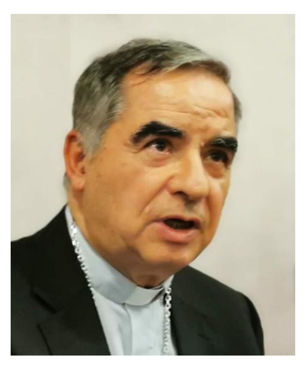
Cardinal Angelo Becciu in 2020

One thing is clear. Those involved in the scandal were either corrupt, stupid or both.