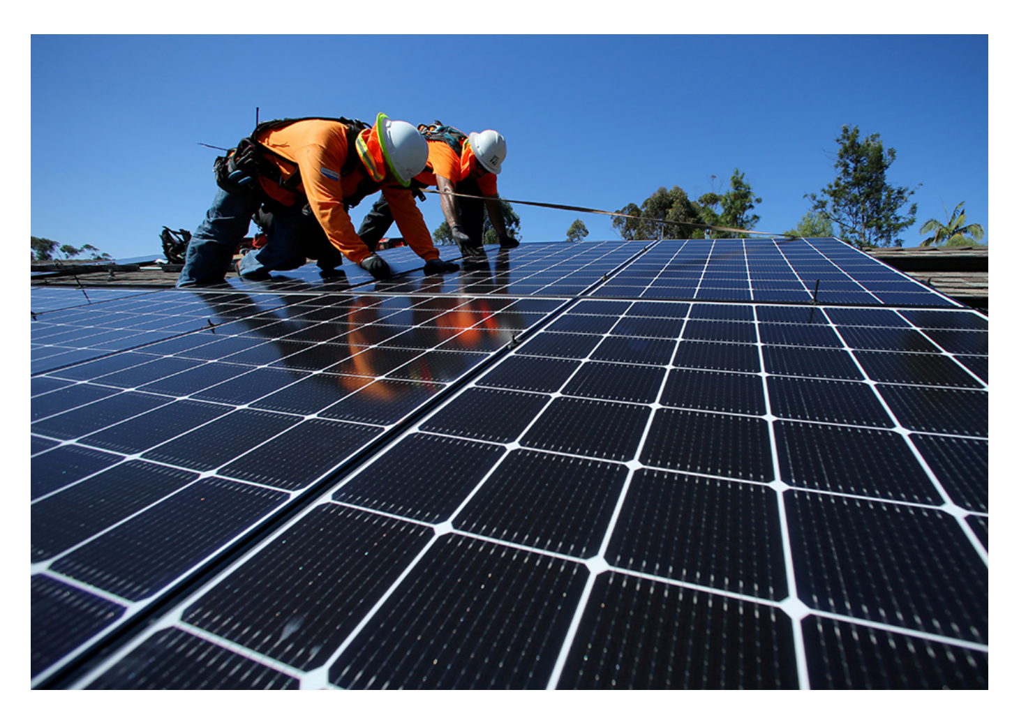
Solar installers are seen on a residential home Oct. 14, 2016, in Scripps Ranch, California.

On other climate solutions, planting 1 trillion trees to absorb carbon emissions has near universal support (89%). Most Americans also favor requiring oil and gas companies to seal methane leaks from oil wells (85%), providing businesses tax credits for carbon capture and storage technologies (76%), taxing corporations for their carbon emissions (70%), and requiring power plants to eliminate carbon emissions by 2040 (61%). But 51% oppose requiring new buildings to run only on electricity.