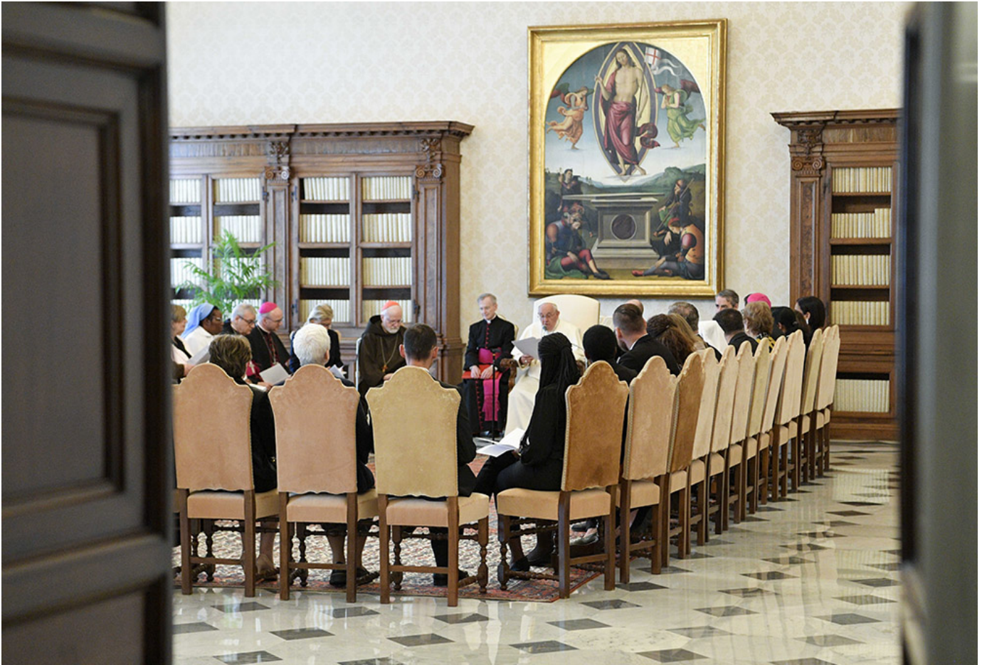
Pope Francis addresses the leadership, staff and members of the Pontifical Commission for the Protection of Minors during an audience at the Vatican.