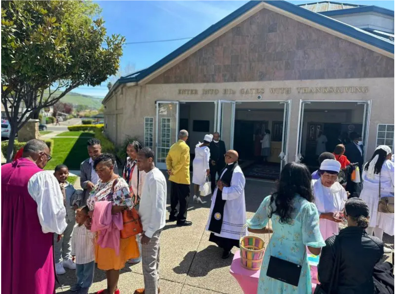
Glad Tidings International Church, April 2023