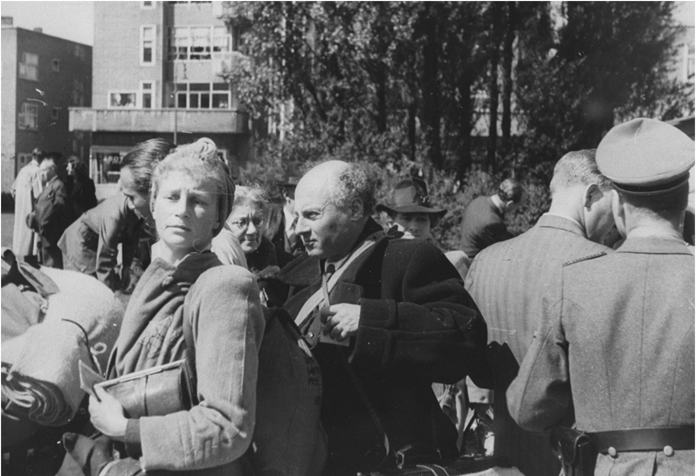
Amsterdam Jews await deportation to the Nazi transit camp in Westerbork, the Netherlands, on June 20, 1943. A member of the German Security Police can be seen at right.