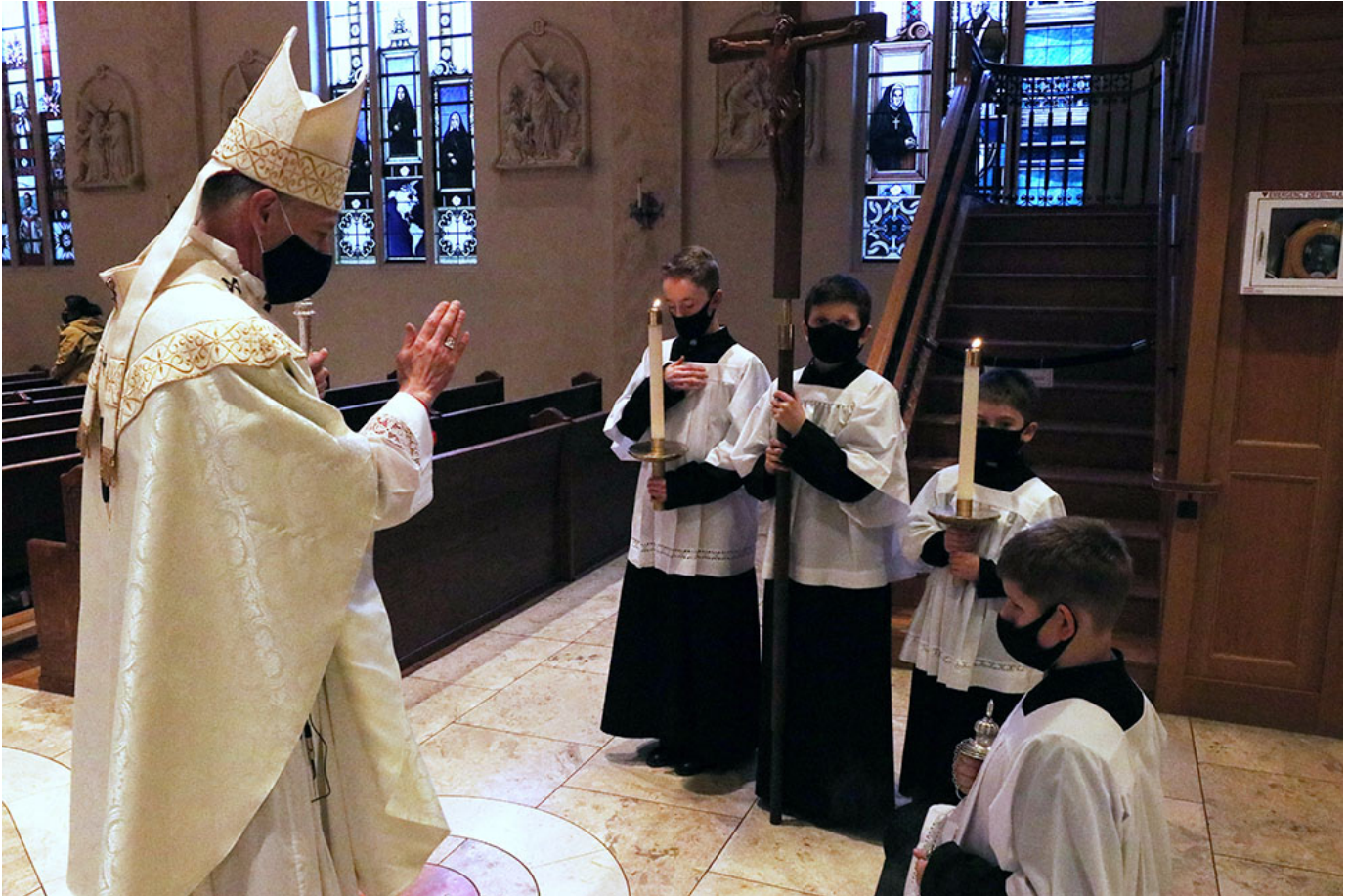
Archbishop Alexander Sample of Portland, Oregon, blesses altar servers after the Mass for the feast of St. Joseph March 19, 2021, at St. Mary's Cathedral of the Immaculate Conception in Portland.

From my experience of the discourses around gender in ecclesial circles, I have come to the realization that there seems to be a lack of awareness of the phenomenological nature of gender. Gendered self-understanding is not within the domain of conceptualization. Rather, it is within the domain of sociocultural and political constructions of identities.