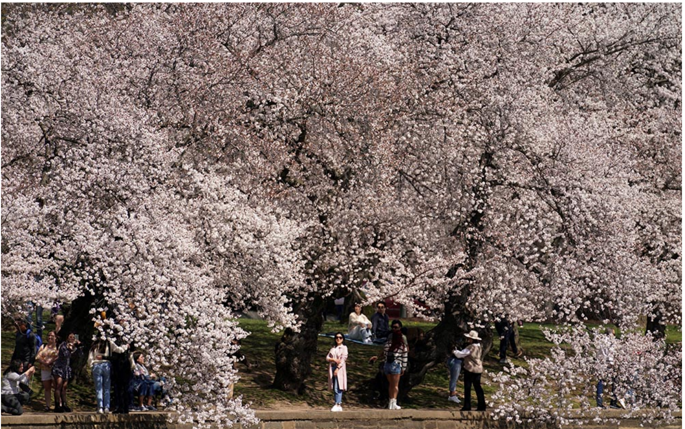
People in Washington are seen under a canopy of cherry blossoms in peak bloom March 21, 2022.

The nation's capital has a deep-rooted history with trees. Tourists and locals flock each spring to the Tidal Basin for the annual Cherry Blossom Festival, and as far back as the 1800s, Washington, D.C., garnered the nickname "the City of Trees" for the thousands that lined its streets. As of 1950, tree canopy covered half of the district's map.