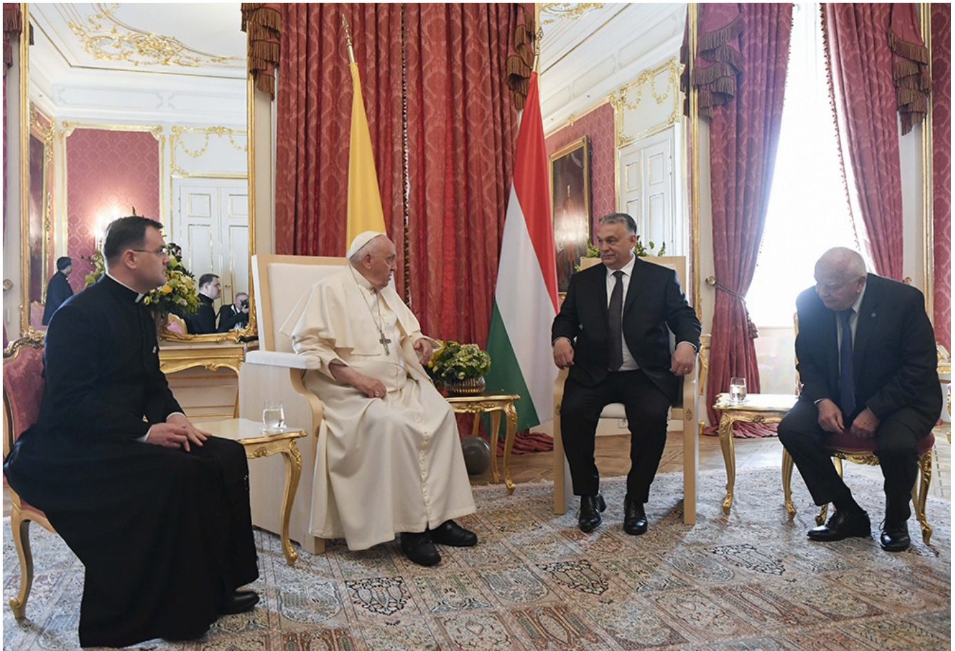
Pope Francis meets with Hungarian Prime Minister Viktor Orbán at Sándor Palace April 28 in Budapest, Hungary.