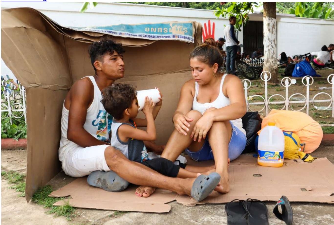
A migrant family in Huehuetán, Mexico, rests at a park with other caravan migrants heading to the U.S. border Nov. 18, 2021.