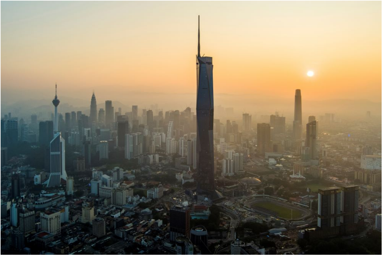
The sun rises over downtown Kuala Lumpur, Malaysia on April 11, 2023.