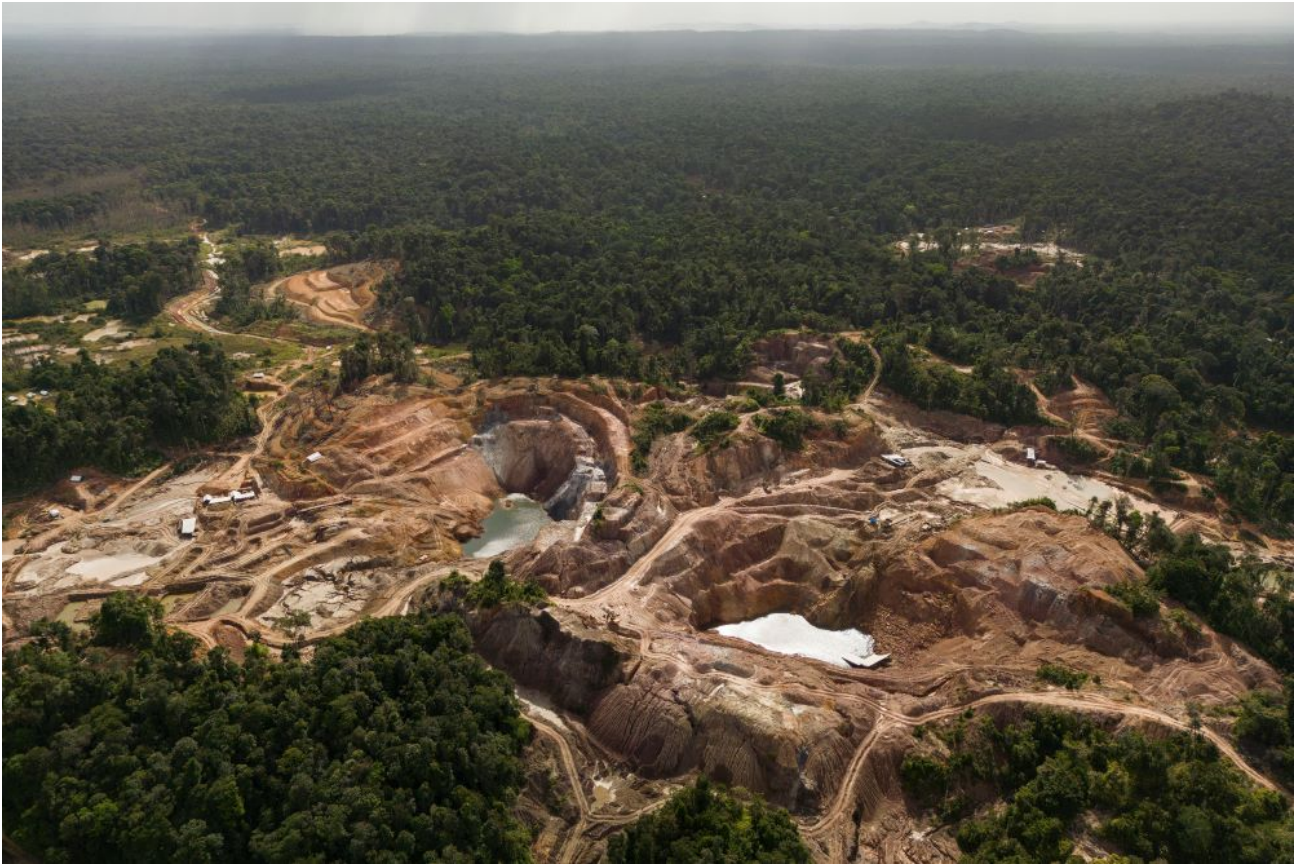
The Tassawini Gold Mines are visible amid trees in Chinese Landing, Guyana, Monday, April 17, 2023.