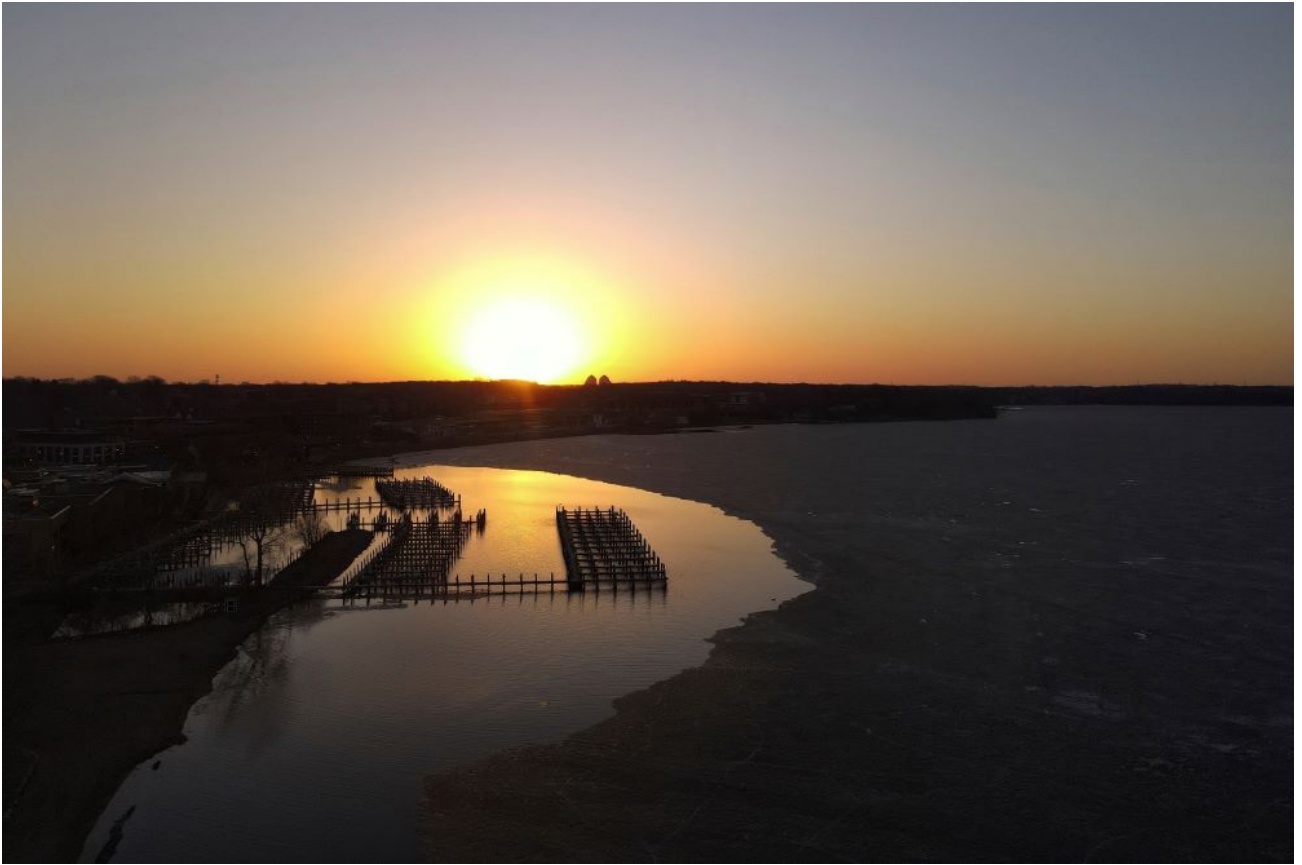
Boat docks are visible where ice has thawed at Wayzata Bay in Lake Minnetonka, Thursday, April 13, 2023, in Wayzata, Minn.