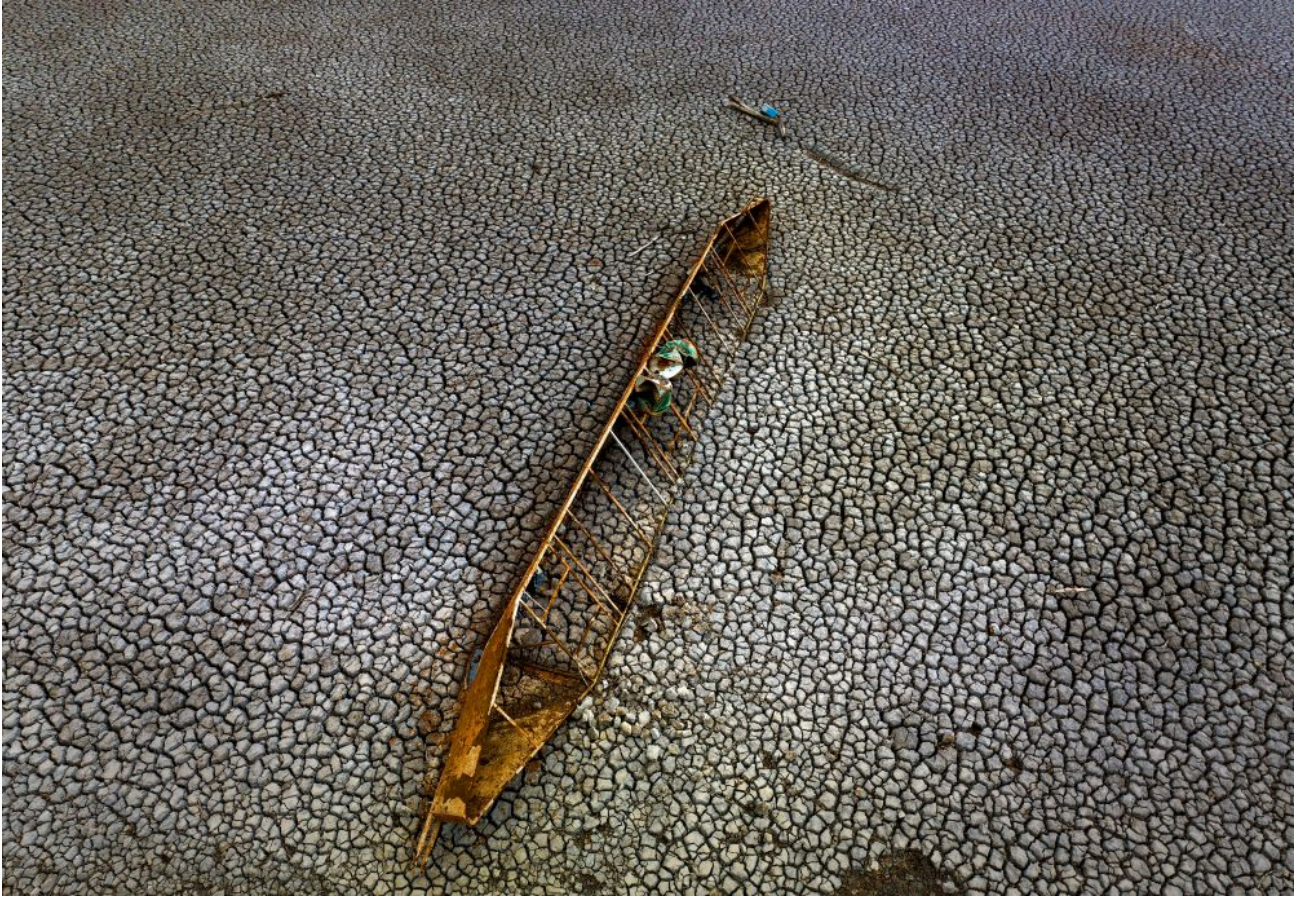
An old boat is photographed half-buried after the water level has dropped at the Sau reservoir, about 100 km (62 miles) north of Barcelona, Spain, Tuesday, April 18, 2023.