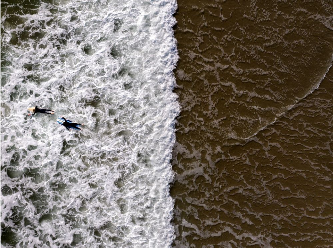
Two surfers waded through water in Huntington Beach, Calif., Monday, April 17, 2023.