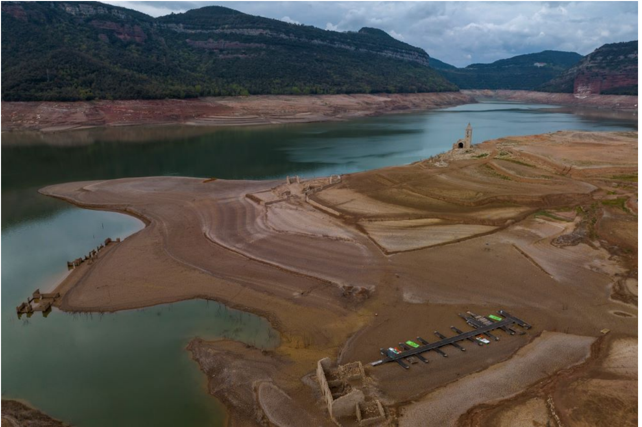
Dry, cracked land is visible around at the Sau reservoir, about 100 km (62 miles) north of Barcelona, Spain, Tuesday, April 18, 2023.