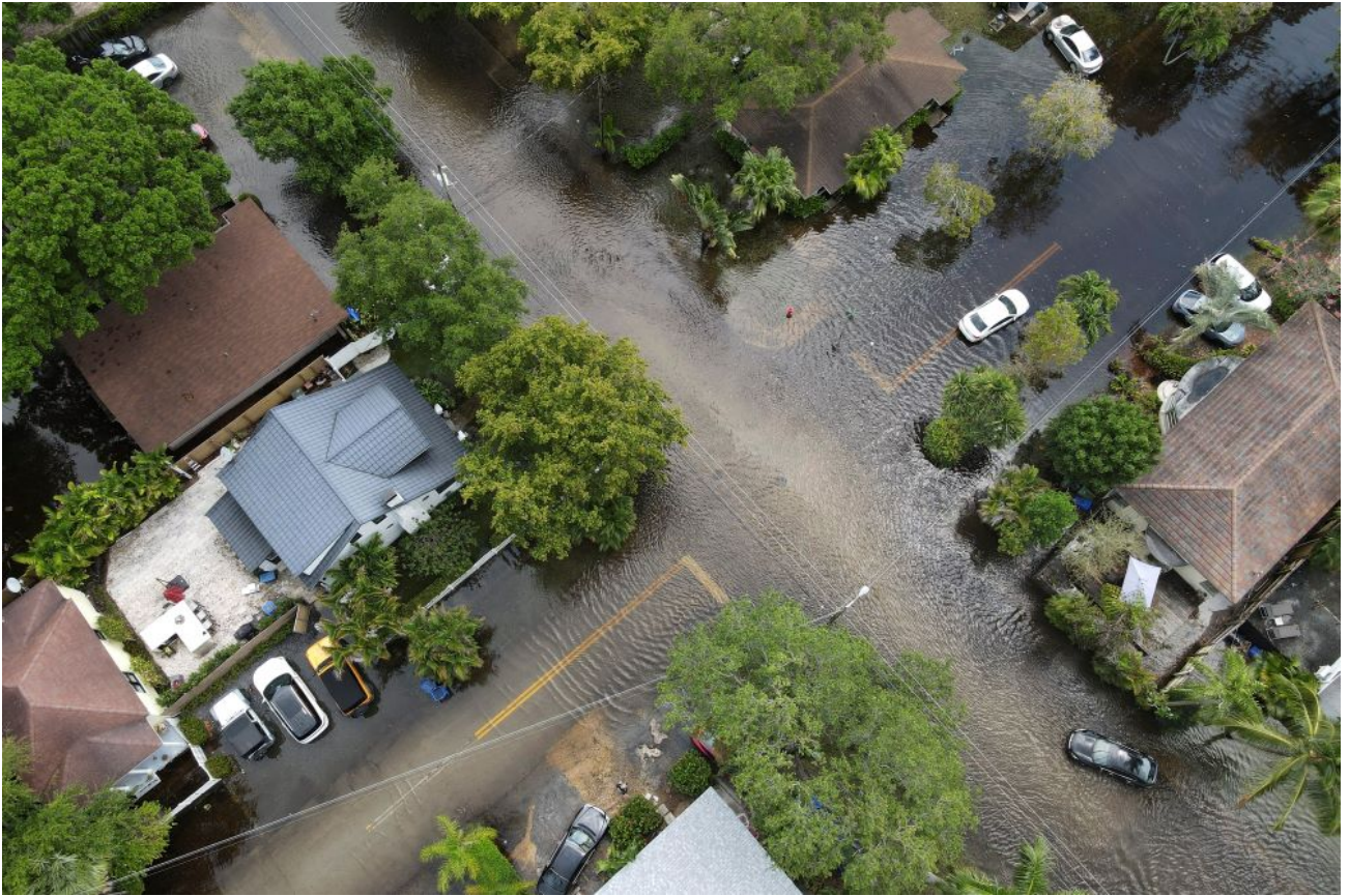
A pair of waterlogged cars sit abandoned in the road as floodwaters recede in the Sailboat Bend neighborhood of Fort Lauderdale, Fla., Thursday, April 13, 2023.