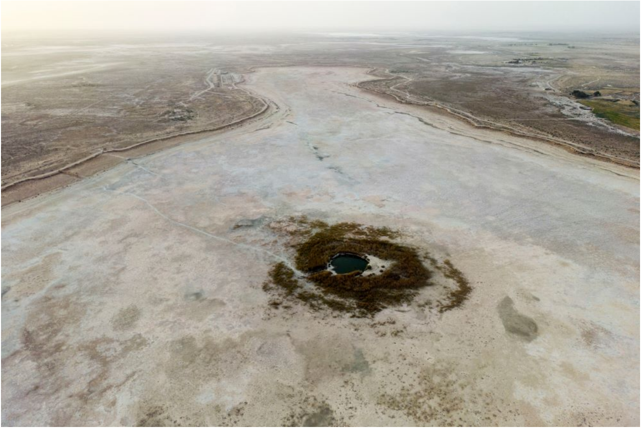
A dried Sawa Lake is surrounded by a dry bed in Iraq, Monday, April 10, 2023.