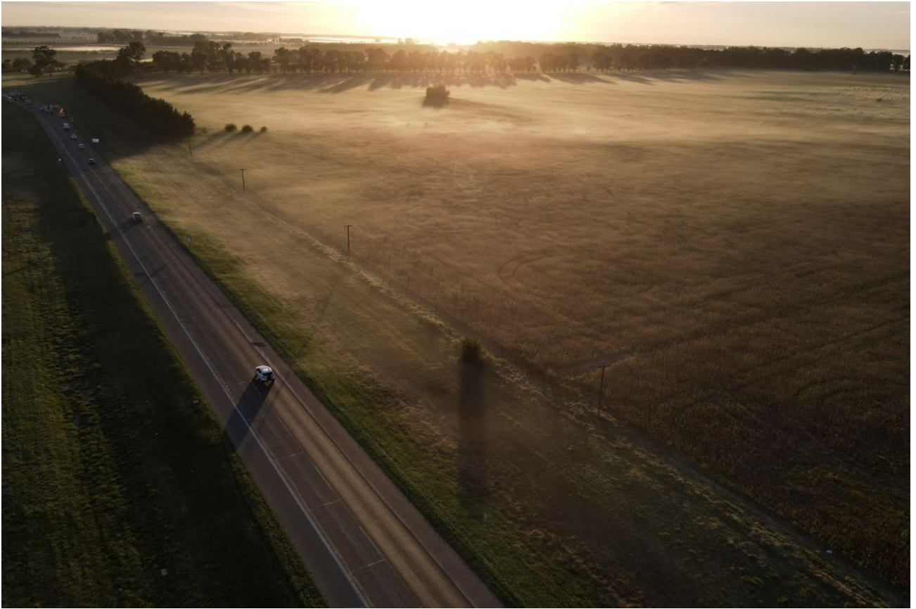
A car drives down a road near farmland in Lobos, Argentina, Friday, April 14, 2023. Huge amount of the harvest of soybean and corn has been lost in Argentina due to drought.