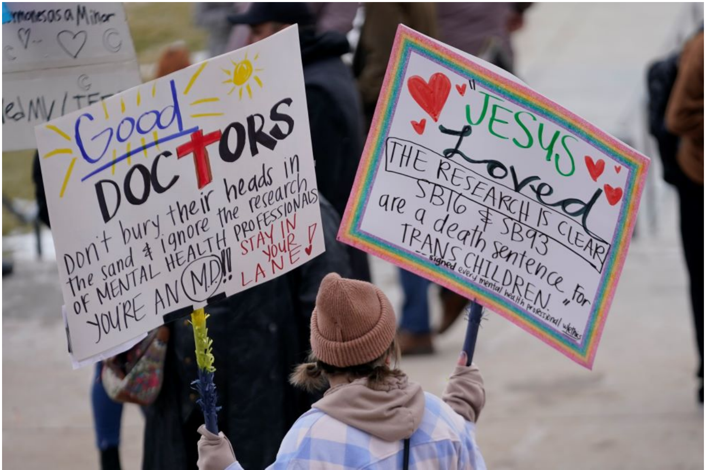
People gather in support of transgender youth during a rally at the Utah State Capitol Jan. 24, 2023, in Salt Lake City.

The debate over gender is framed by traditionalist Christians as a struggle between "reality" and "ideology." But the church already has a preferred ideology of gender, which is complementarian, essentialist and committed to a rigid binary view of the entire natural world. The real debate is not over whether gender ideology is bad but over which ideology about gender aligns better with reality.