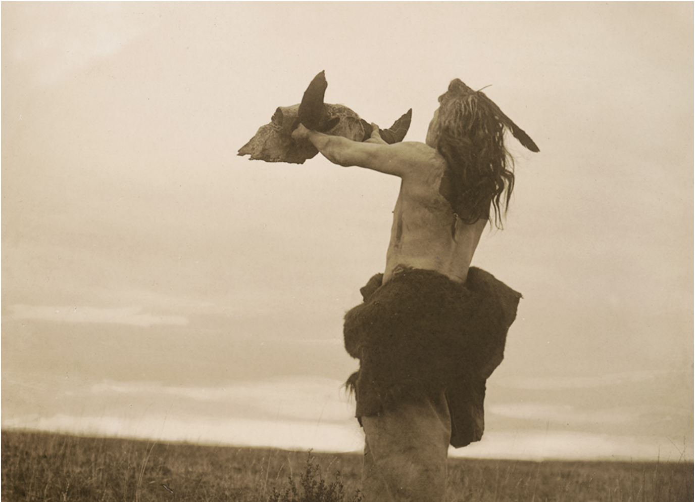
"Offering the Buffalo Skull," a photo of a Mandan Indian man, circa 1908