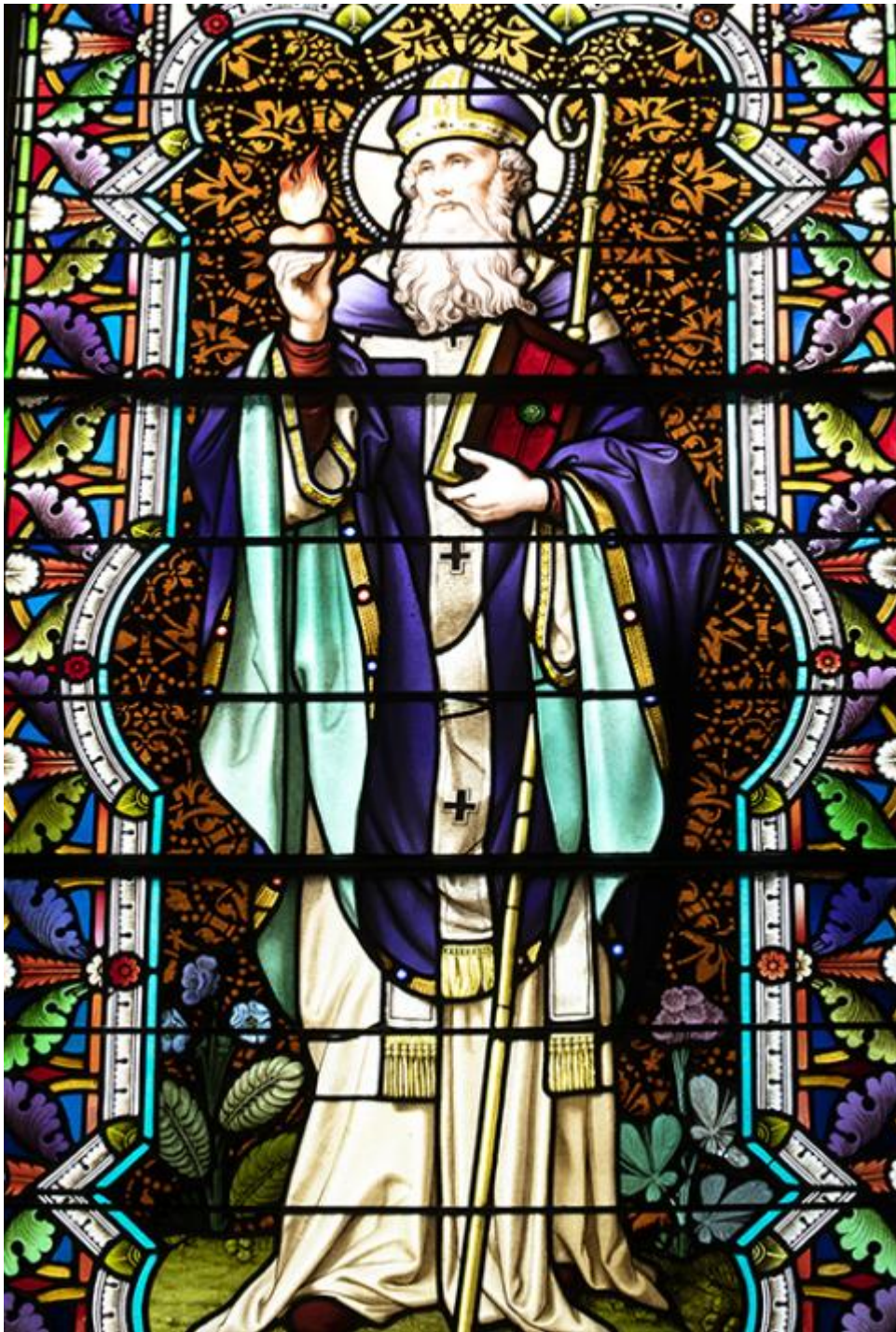
A likeness of St. Augustine is seen in stained glass at Caldwell Chapel on the campus of The Catholic University of America May 25, 2021, in Washington.