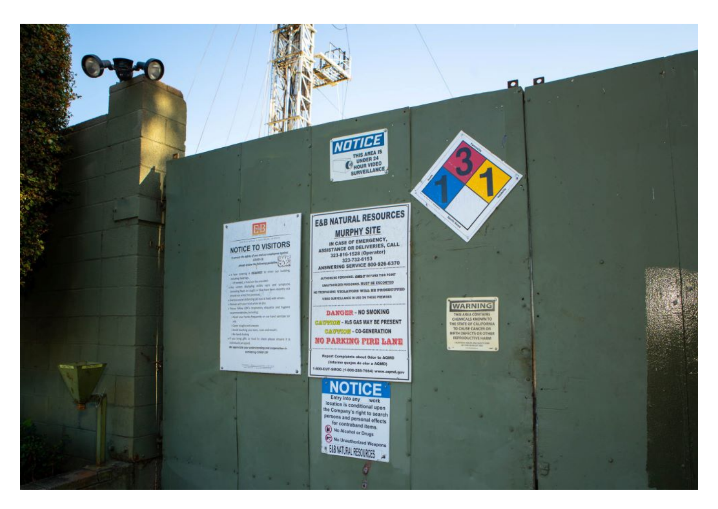
Signs on the Murphy Drill Site gate.

Further, the letter also imposes new conditions and appears to address some of the community's highest-priority demands, such as the construction of a 45-foot-tall barrier to enclose the site within two years, and the transition to exclusive use of electric power for onsite operations.