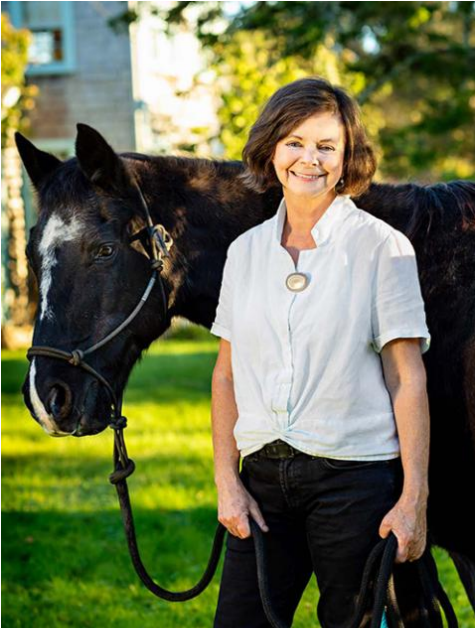
Geraldine Brooks, author of the novel Horse

Brooks immerses readers in 19th-century horse racing. The races of the period featured grueling 4-mile heats — and sometimes more than one. Sports newspapers covering horse races had better circulation than most other newspapers. Winning horses were better known and admired than most public figures. Gambling was rampant. The egos of wealthy and powerful owners were involved. Modern-day American football or worldwide soccer probably offer the best comparisons to the sport as it existed during the mid-19th century.