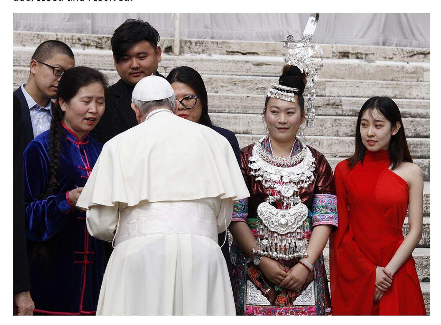
Pope Francis greets pilgrims from China during his general audience in St. Peter's Square at the Vatican March 28, 2018.

"Here we must make one thing clear, without any illusions," he added. "The agreement is exclusively about appointing bishops, while the other open questions concerning the life and the difficulties of the church are waiting to be properly addressed and resolved."