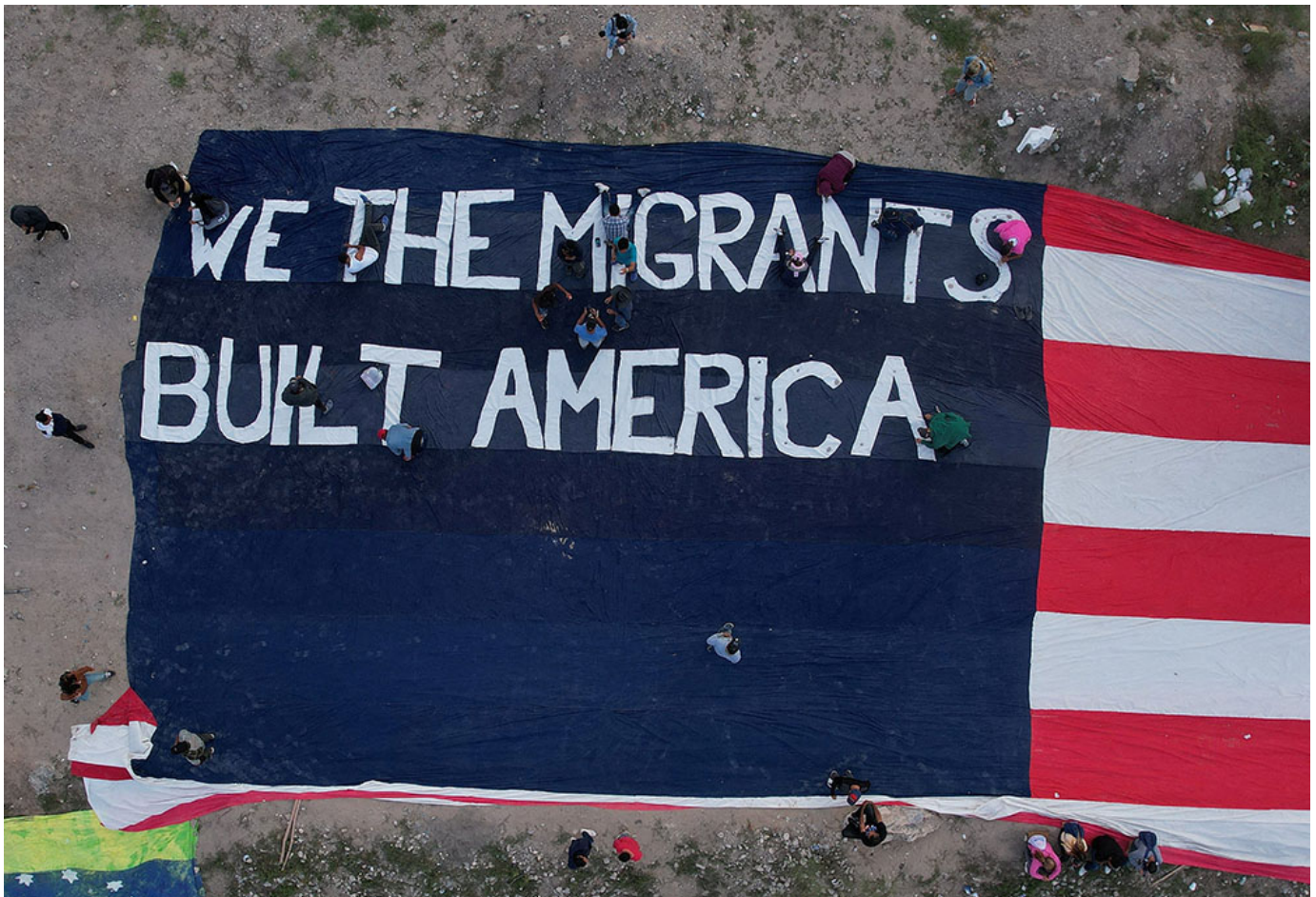
Migrants at a camp near the banks of the Rio Bravo in Ciudad Juárez, Mexico, make a large banner in the likeness of the U.S. flag Oct. 30, 2022.