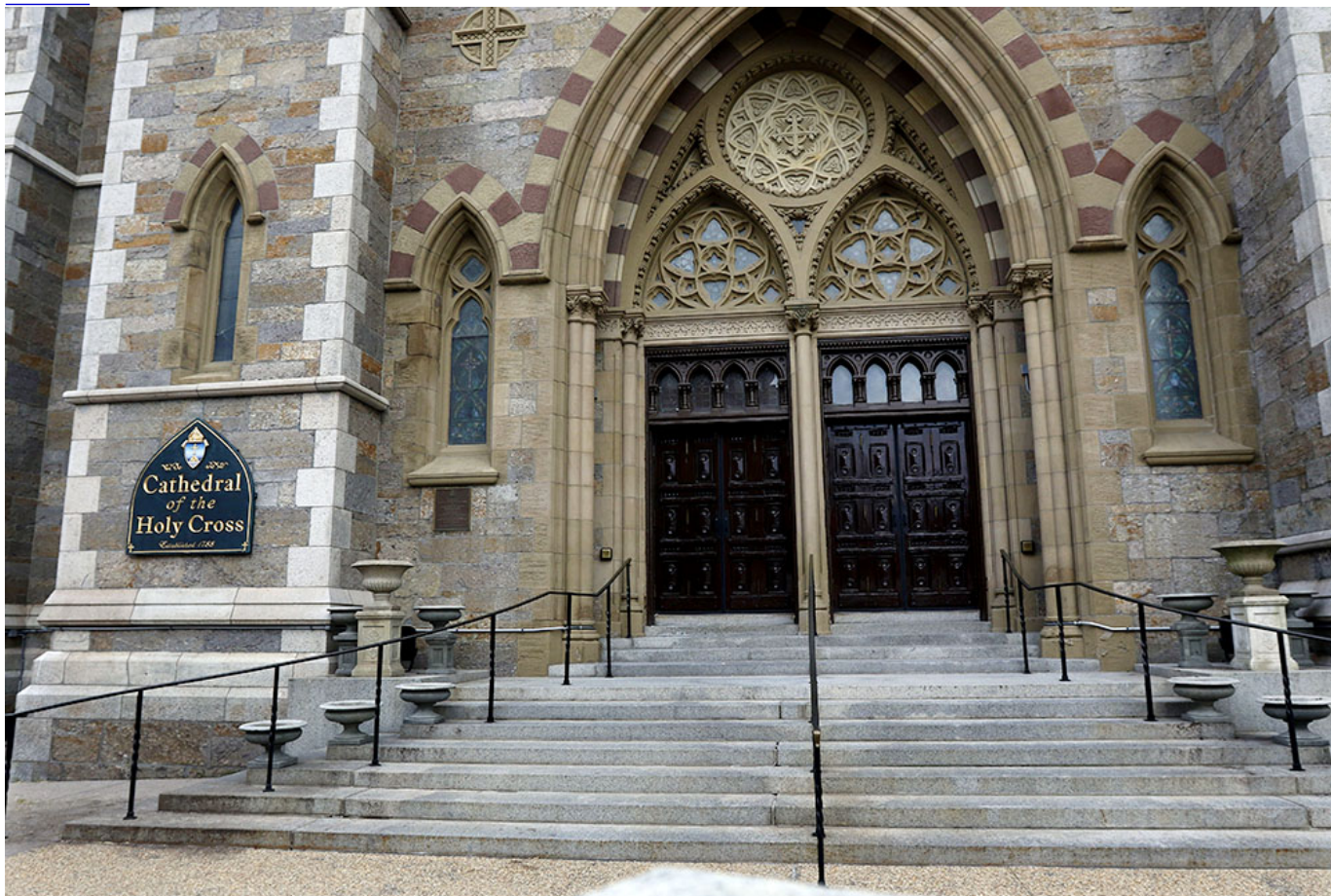
The Cathedral of the Holy Cross in the Boston Archdiocese