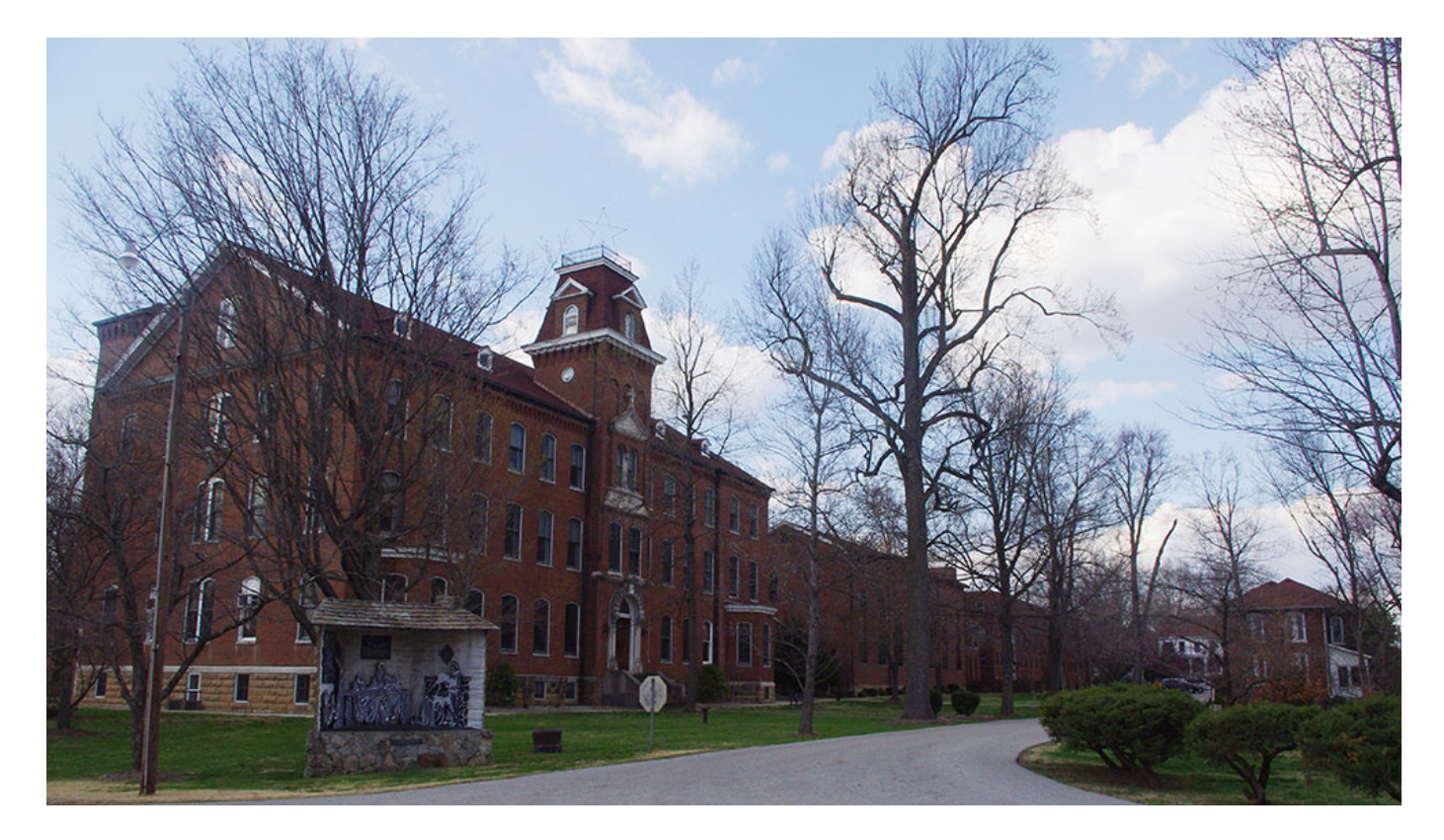
The Loretto Motherhouse in Nerinx, Kentucky

Among the land left out of the easement is the 30-acre motherhouse campus that includes the church, convent and nursing home. Another 75 acres was designated for future needs — whether for the Lorettos or the land's next owners — for instance, housing for migrant farmworkers.