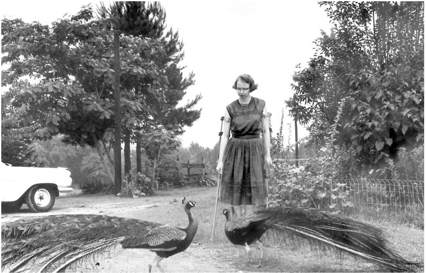
The writer Flannery O'Connor is seen in this 1962 photo.