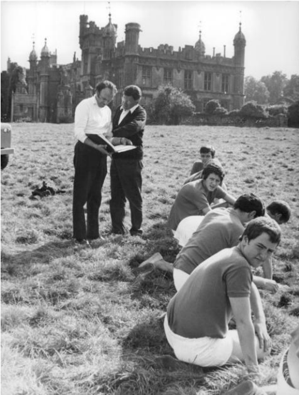
Pictured is a scene from the 1967 British comedy "Decline and Fall of a Birdwatcher" an adaption of Evelyn Waugh's first novel, "Decline and Fall," published in 1928.

cuts away at everything that veils sin. In his 1934 novel A Handful of Dust , that veil is made of fame, privilege, power, class and socialite culture. Waugh tears the veil away in a scene that can't be forgotten. A mother who pursues a romantic affair with an awful man called John — who bears the same name as her young son — receives news that "John" had suffered a terrible accident. As it slowly dawns on her that the victim is her little boy and not her lover, her initial reaction is to thank God in relief — before bursting into tears. The horrible scene is compelling because it's so authentically human.