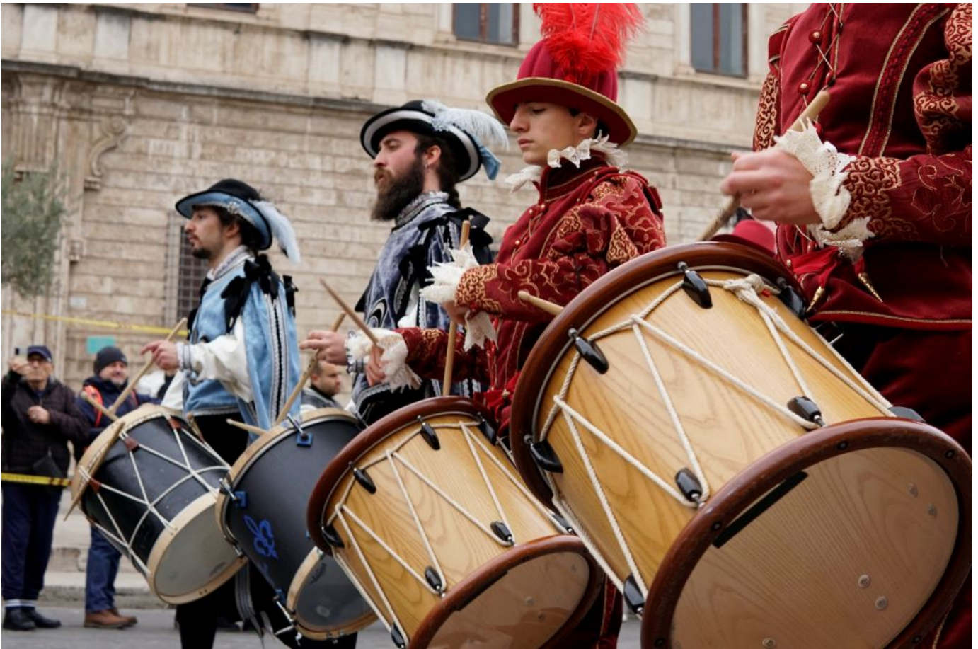
Drummers participate in a parade marking the feast of the Epiphany in Rome near the Vatican Jan. 6.