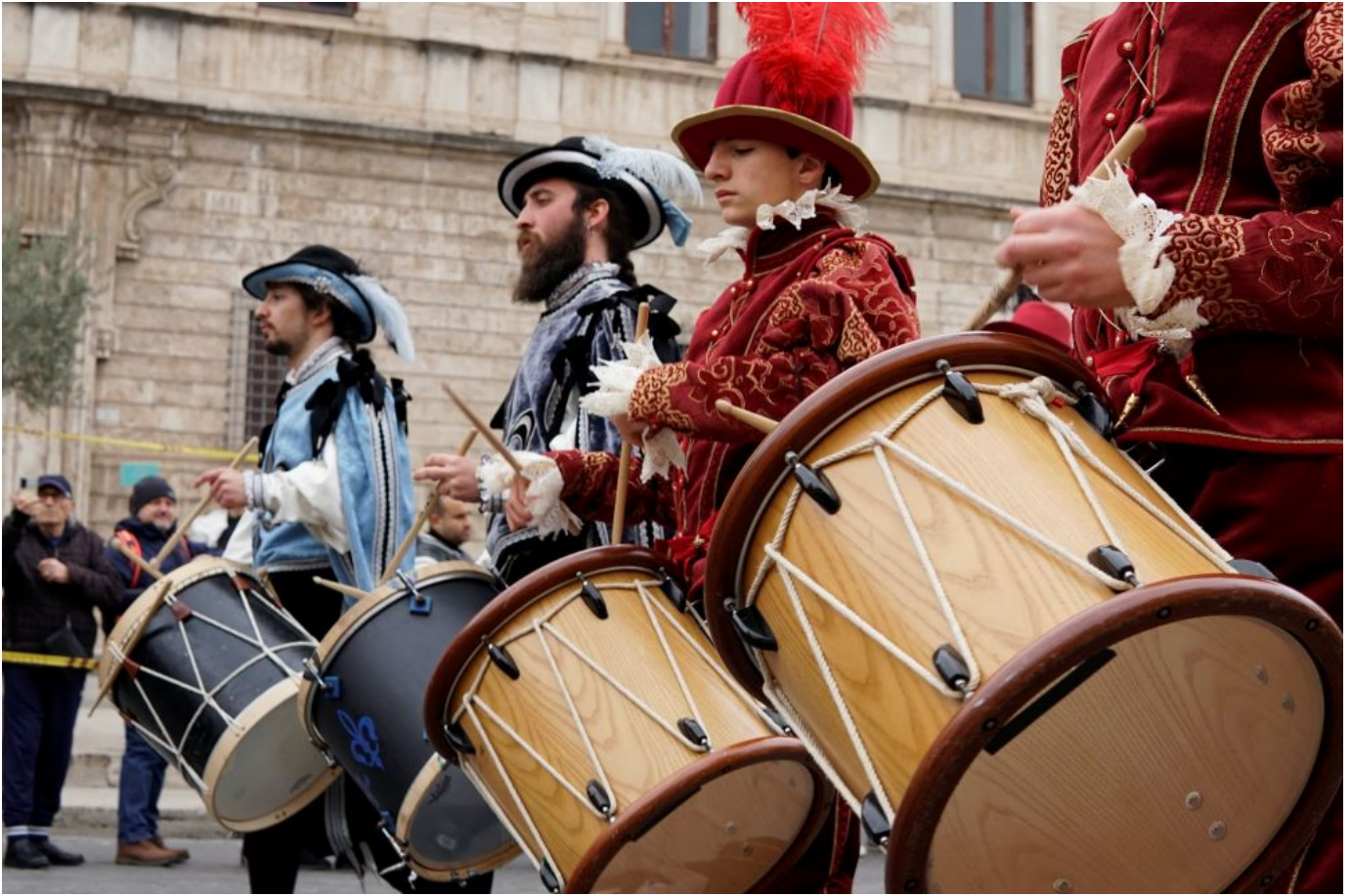
Drummers participate in a parade marking the feast of the Epiphany in Rome near the Vatican Jan. 6.