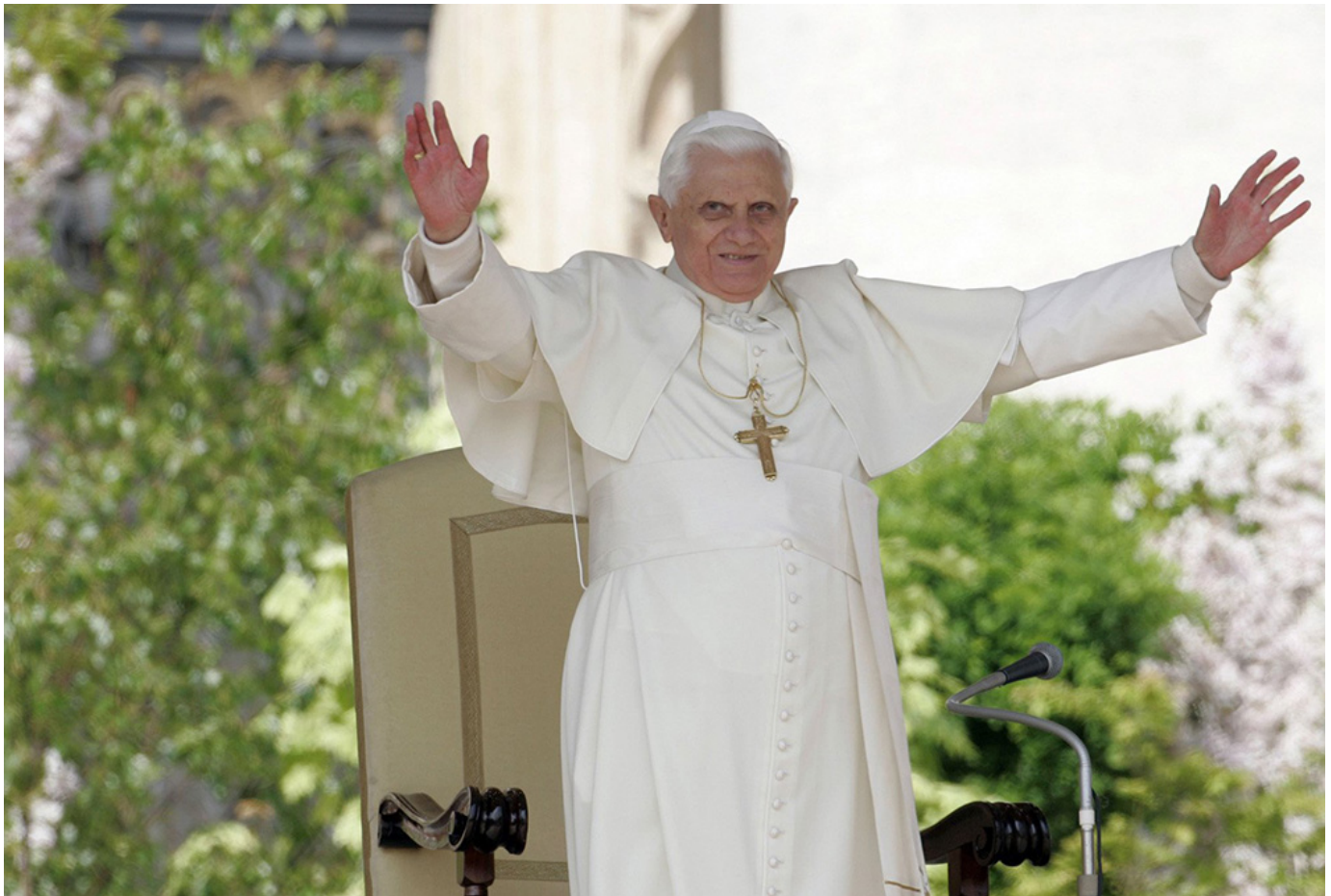
Pope Benedict XVI greets the faithful as he leads his weekly general audience in St. Peter's Square at the Vatican April 11, 2007.

An example of that weaving comes in Caritas in Veritate , where Benedict writes, "The book of nature is one and indivisible: it takes in not only the environment but also life, sexuality, marriage, the family, social relations: in a word, integral human development. Our duties towards the environment are linked to our duties towards the human person, considered in himself and in relation to others."