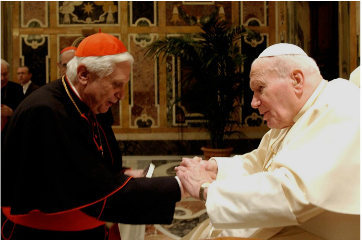
Cardinal Joseph Ratzinger greets Pope John Paul II during a 2004 ceremony at the Vatican.