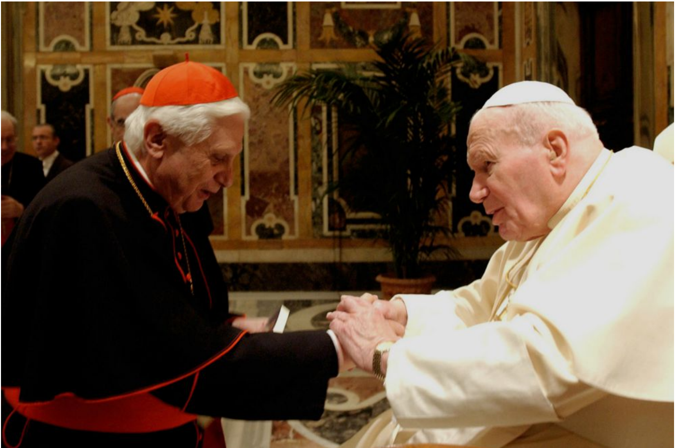
Cardinal Joseph Ratzinger greets Pope John Paul II during a 2004 ceremony at the Vatican.