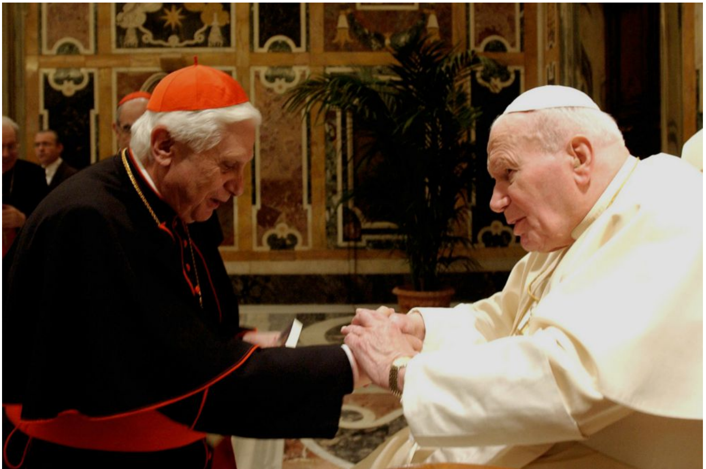
Cardinal Joseph Ratzinger greets Pope John Paul II during a 2004 ceremony at the Vatican.