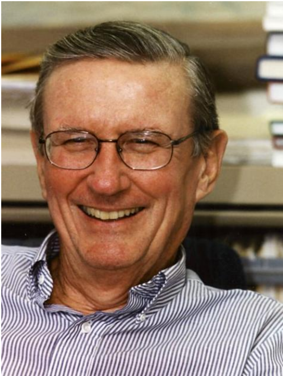
Fr. Charles Curran

Several months after the meeting, Curran received a letter from the congregation, stating that he was "not suitable nor eligible to teach Catholic theology." After several years of academic wandering, Curran was offered a tenured position at Southern Methodist University in 1991, where he remains Elizabeth Scurlock University Professor of Human Values.