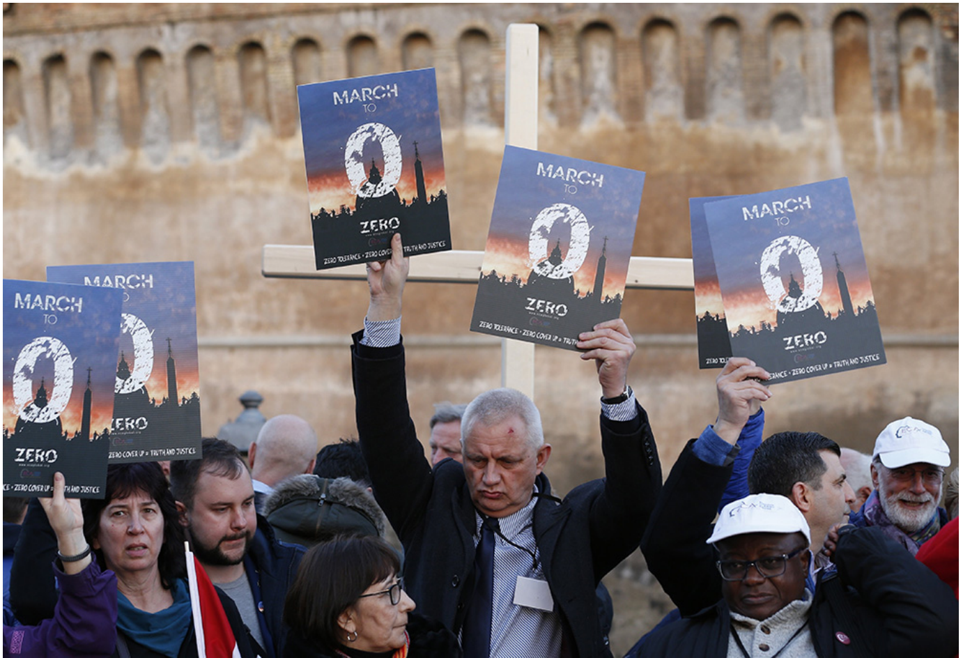
Clerical sex abuse survivors and their supporters rally outside Castel Sant'Angelo in Rome in this Feb. 21, 2019, file photo.

Third dimension: Something that is emerging is the uncertainty or uselessness of the distinction between the clerical hierarchy and multi-vocation charismatic communities, especially in a church that wants to be, in its evangelizing and missionary efforts, all-ministerial. We have come a long way from the time when this could be called the "clergy abuse crisis" — and it's surprising that some scholars are still treating this crisis as something that can be explained mono-causally with clericalism, or with the unique role of the clergy in the Catholic Church.