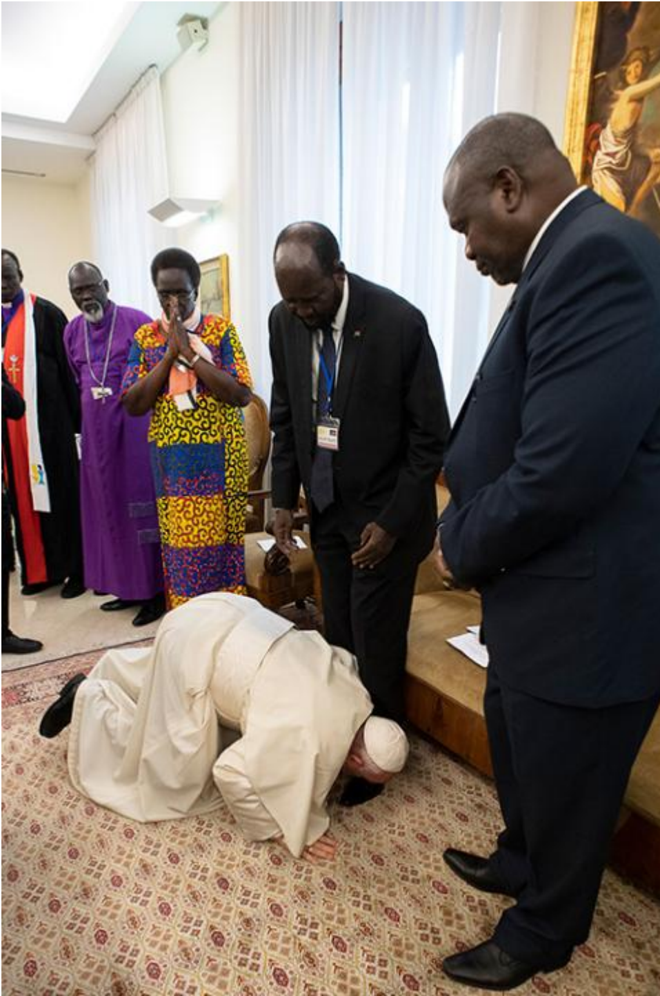
Pope Francis kisses the feet of South Sudan President Salva Kiir April 11, 2019, at the conclusion of a two-day retreat at the Vatican for African nation's political leaders.