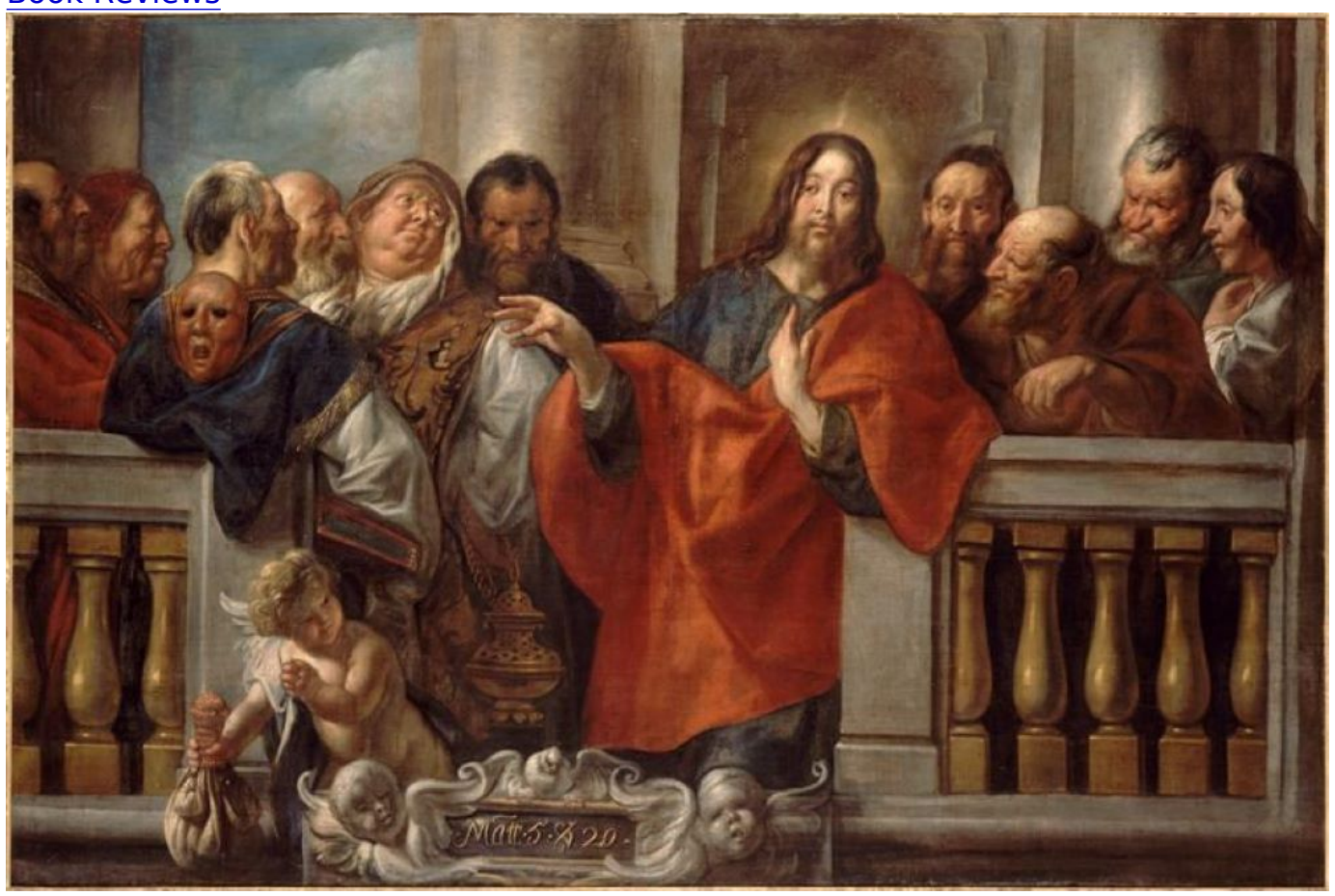
"Christ Among the Pharisees" by Jacob Jordaens, circa 1660