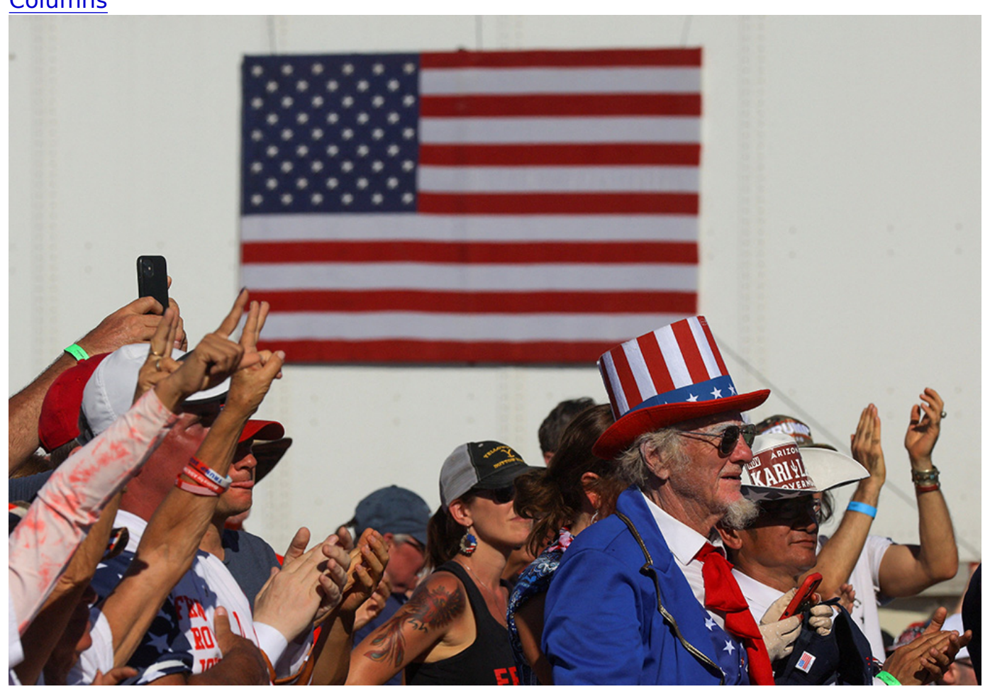
People in Mesa, Arizona, attend a midterm election rally Oct. 9.