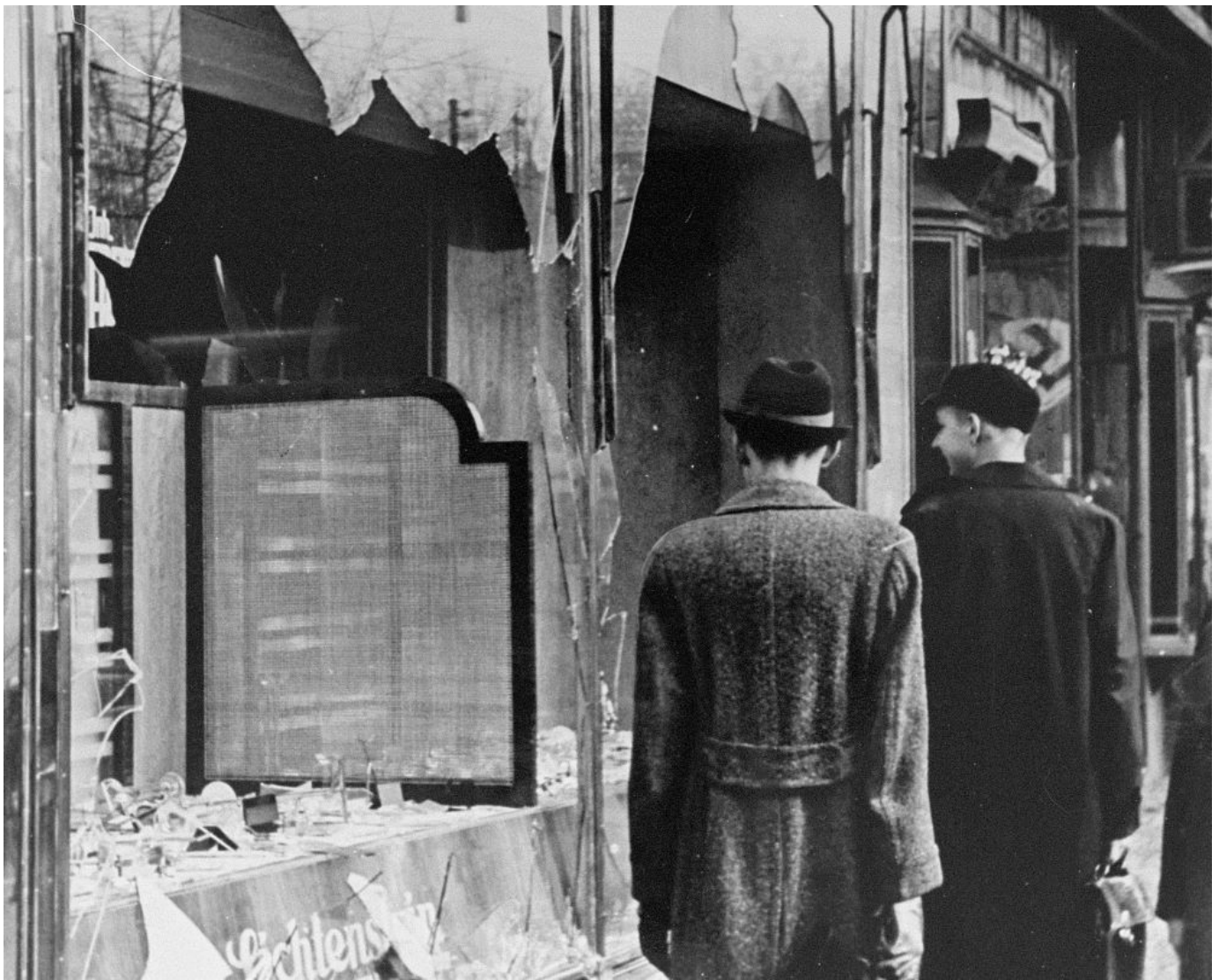
Germans pass the broken shop window of a Jewish-owned business in Berlin that was destroyed Nov. 9-10, 1938, during Kristallnacht, or the "Night of Broken Glass,"

But as much as they misunderstand medieval civilization and the role of liturgy in culture, they are, unfortunately, correct about the antisemitism of medieval Europe. The problem is that instead of viewing medieval antisemitism with horror, as something for which the church should repent, they view it with approval, as something the church should reclaim.