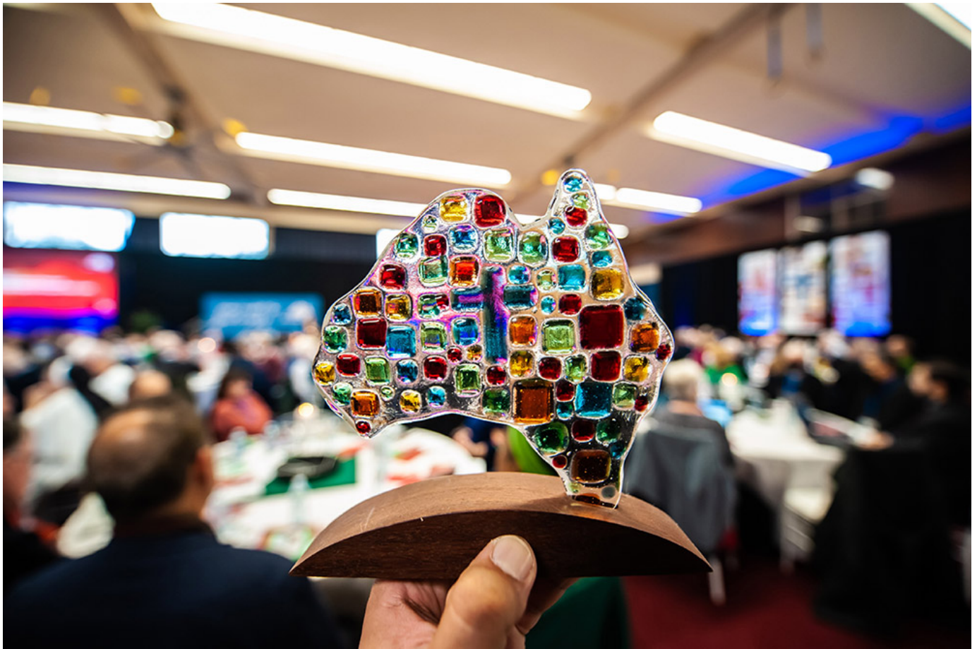
A person in Sydney holds a memento of the Plenary Council of Australia July 4.

A second thing is that you need the right kind of leadership at the right time. As I look back across our Plenary Council journey, I can see how at different times the Spirit raised up different leaders — not all of them ordained — to meet the needs of the moment.