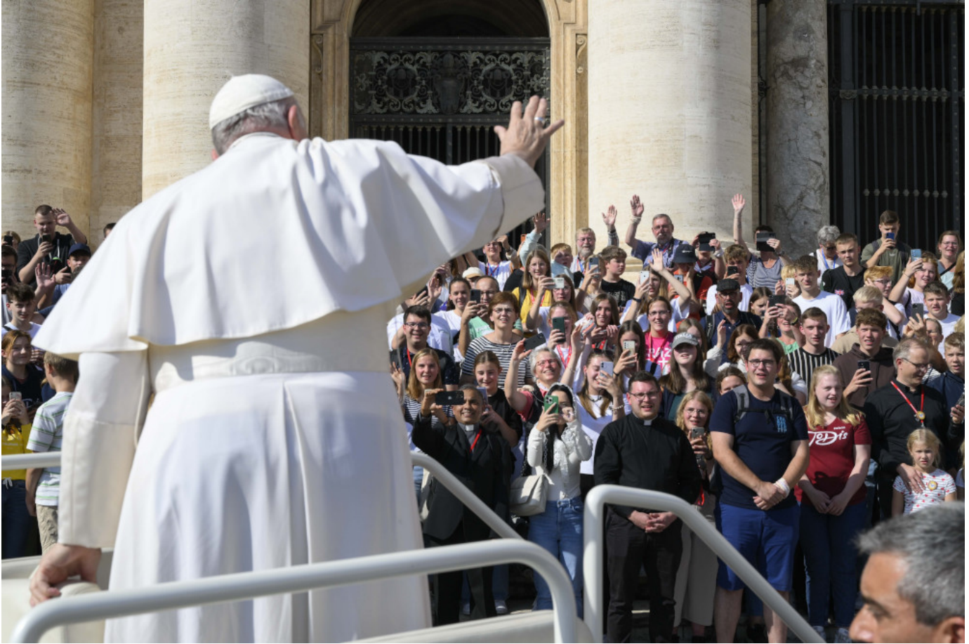
Pope Francis greets the crowd during his general audience in St. Peter's Square at the Vatican Oct. 12.