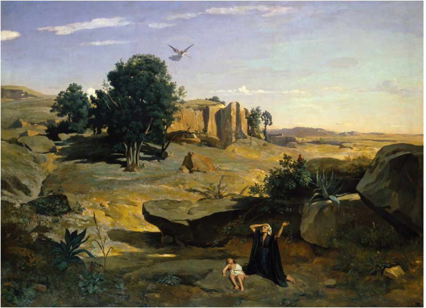
"Hagar in the Wilderness" (1835) by Jean-Baptiste-Camille Corot