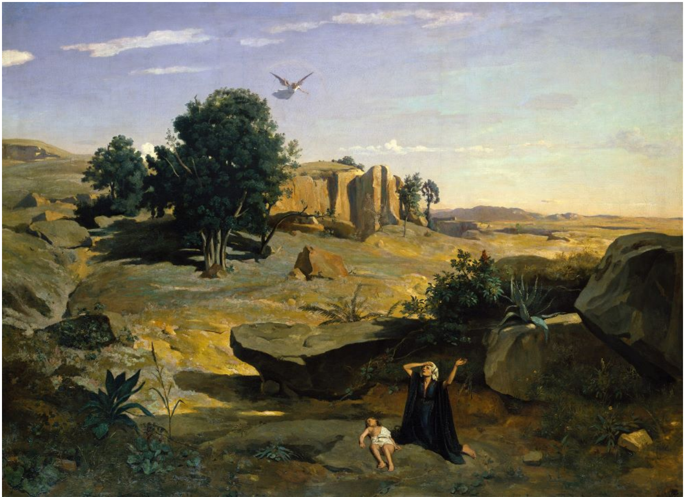
"Hagar in the Wilderness" (1835) by Jean-Baptiste-Camille Corot