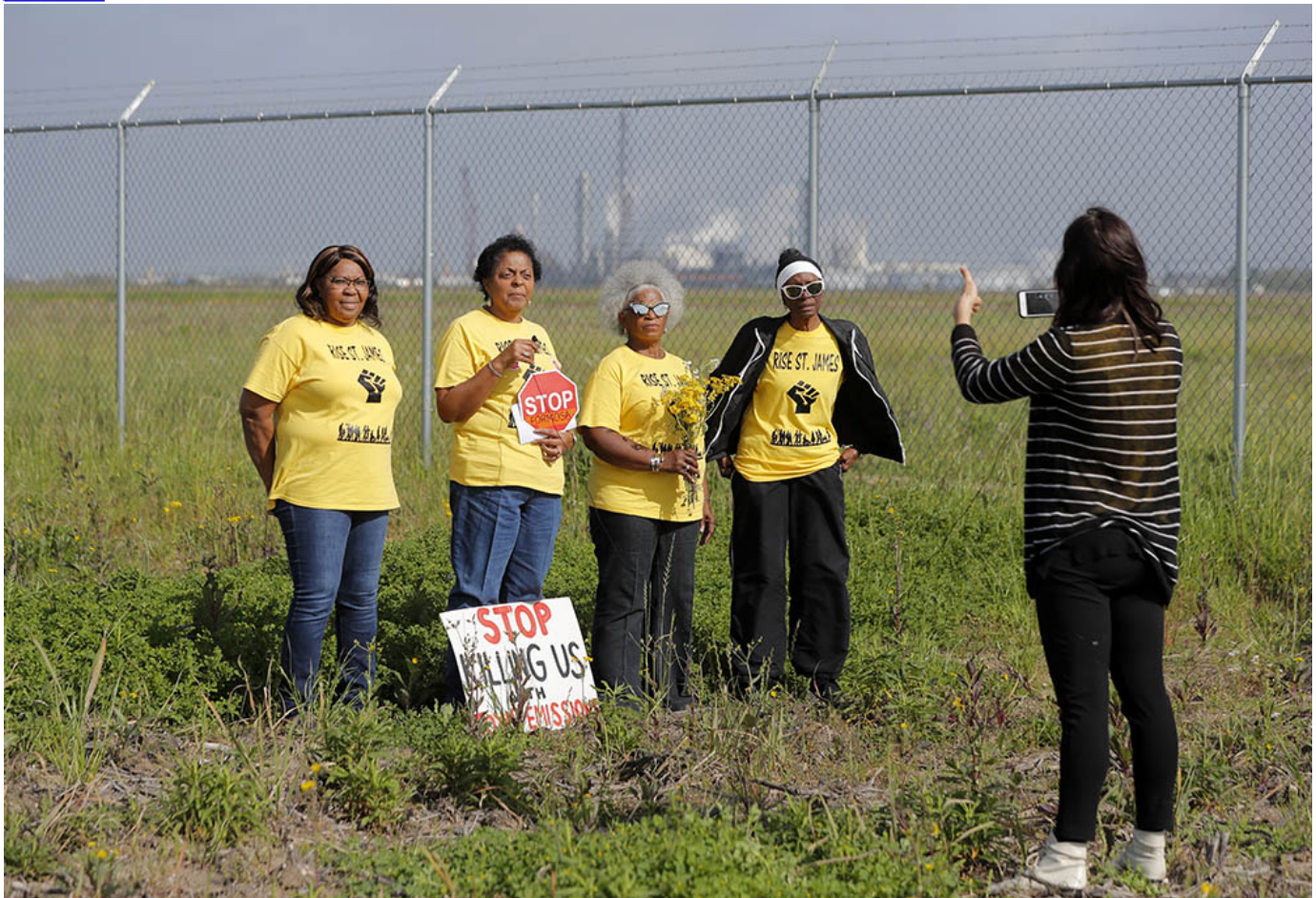
Members of Rise St. James conduct a livestream video on property owned by Formosa Plastics Group in St. James Parish, Louisiana, on March 11, 2020.