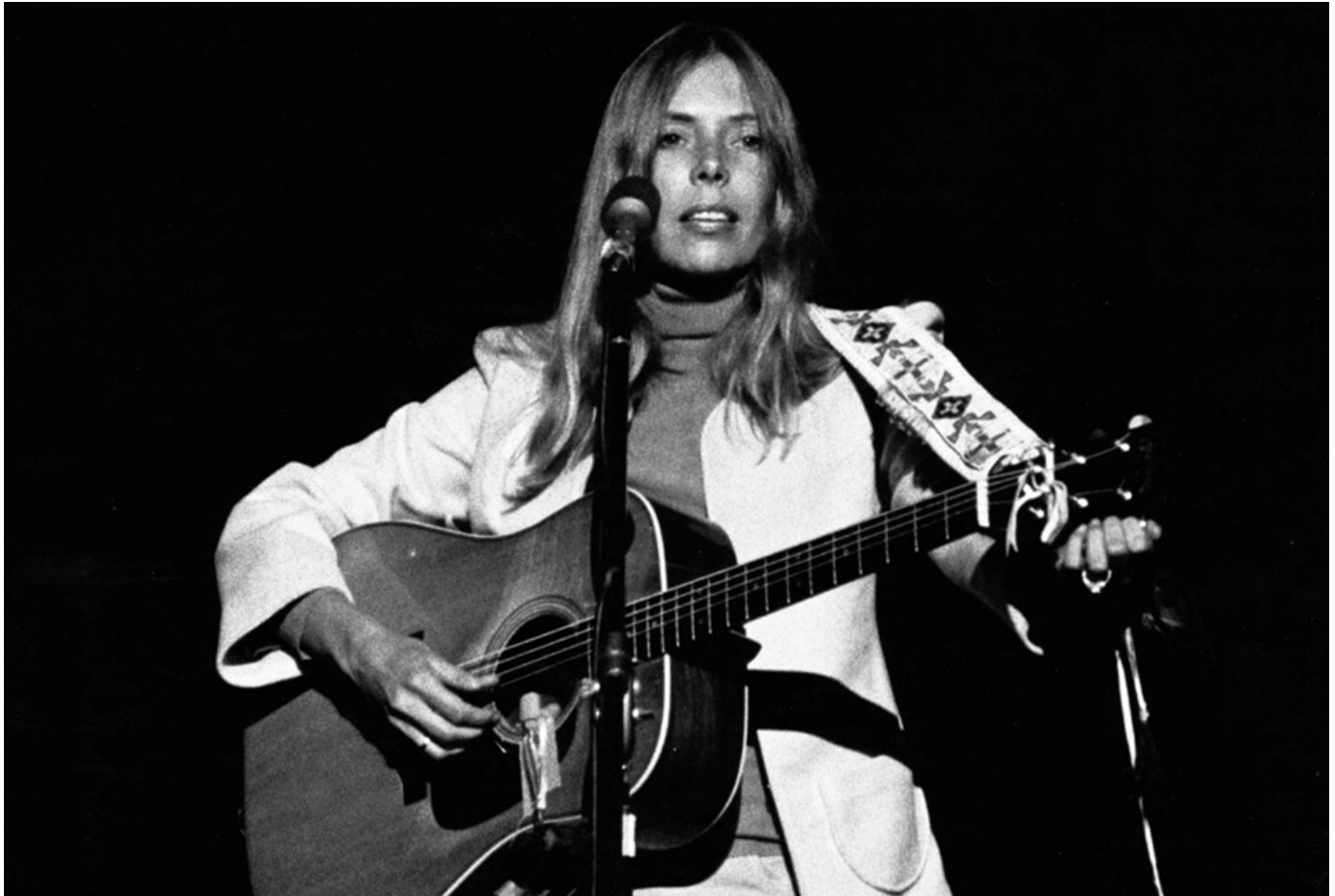
Joni Mitchell in concert at Universal Amphitheater in 1974