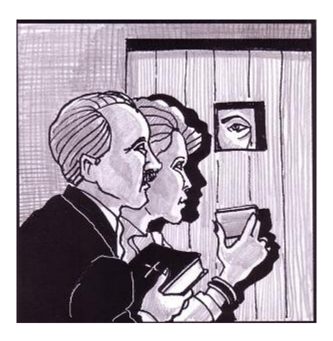
"Lord, will only a few people be saved?" (Luke 13:23).