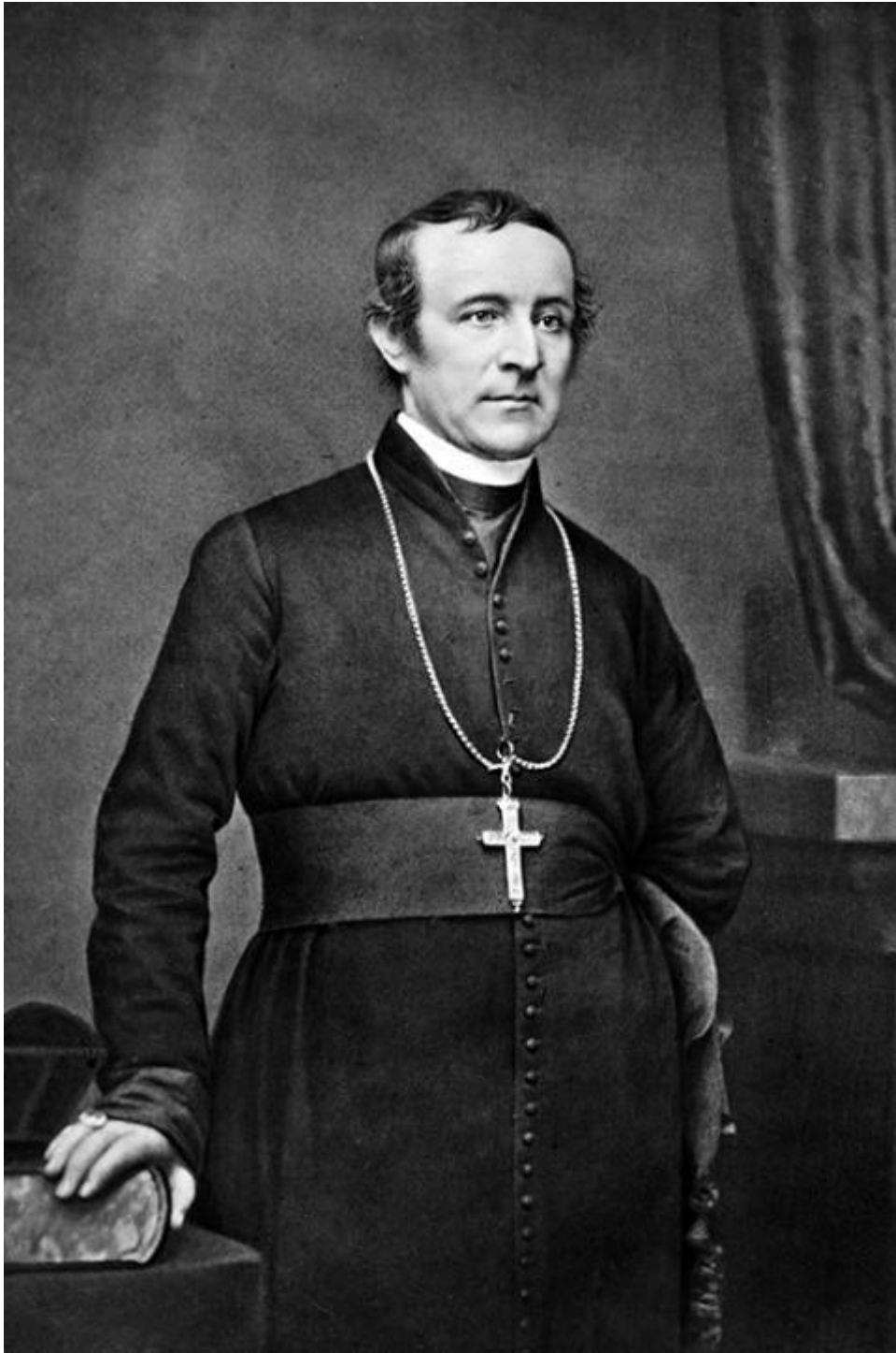
Archbishop John Hughes circa 1860-1865

Hughes later went to New York and demanded taxpayer money to establish a segregated school system for thousands of impoverished "papists" — some of whom later took up arms against the U.S. in the Mexican War, violently opposed Abraham