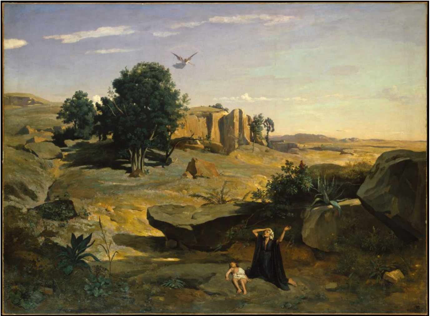
"Hagar in the Wilderness," 1835, by Camille Corot (The Metropolitan Museum of Art/Rogers Fund, 1938)