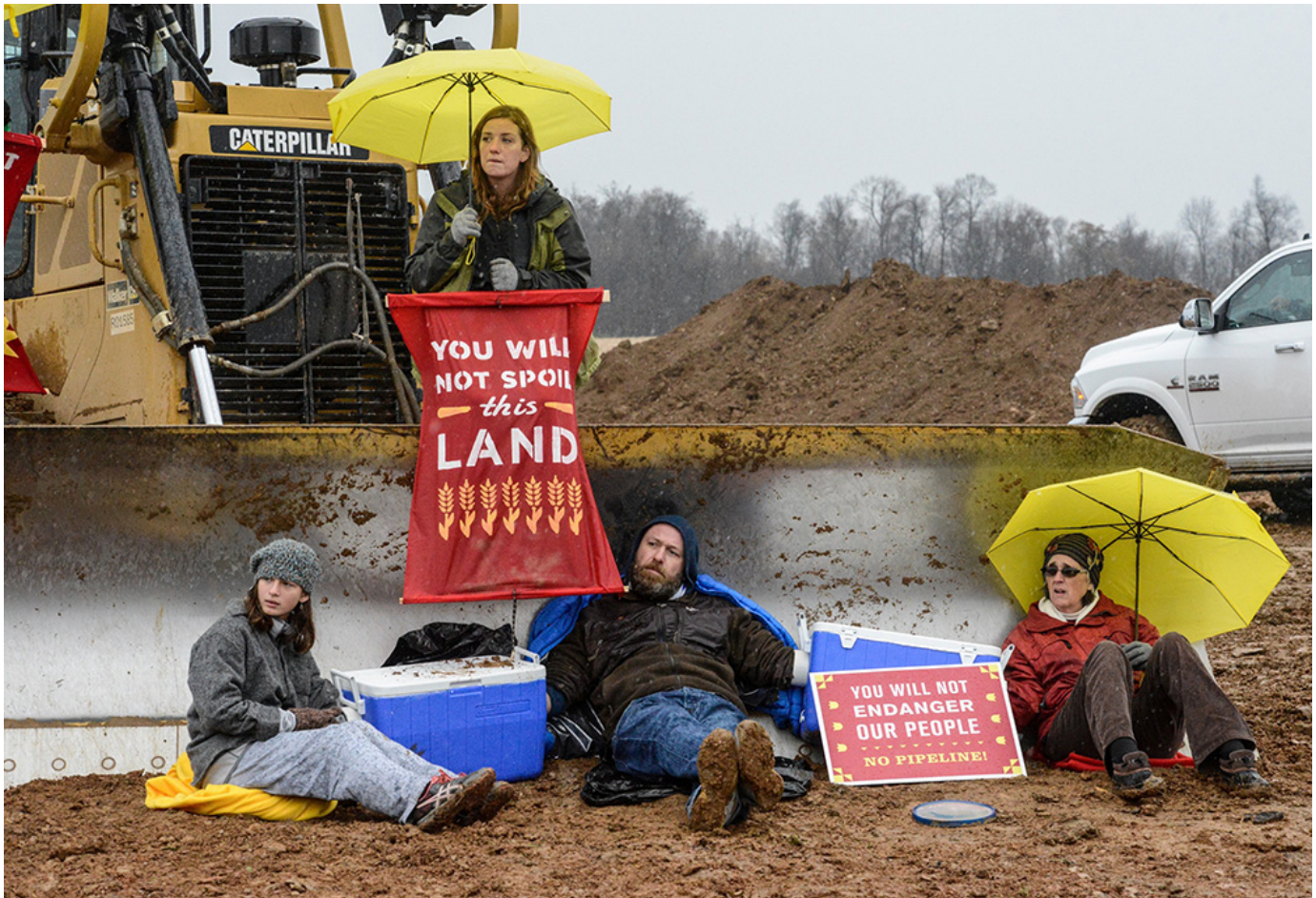
Activists with Lancaster Against Pipelines block construction of a pipeline Nov. 18, 2017, in Holtwood, Pennsylvania.