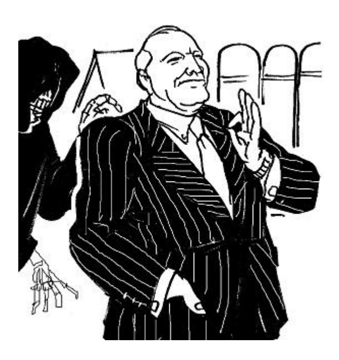
"Be rich in what matters to God" (Luke12:21).