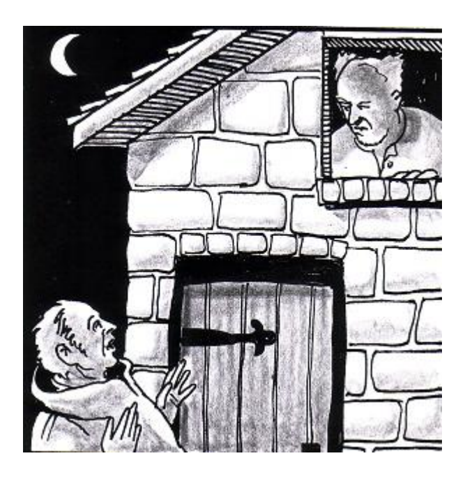
"Knock and the door will be opened to you" (Luke 11:10).