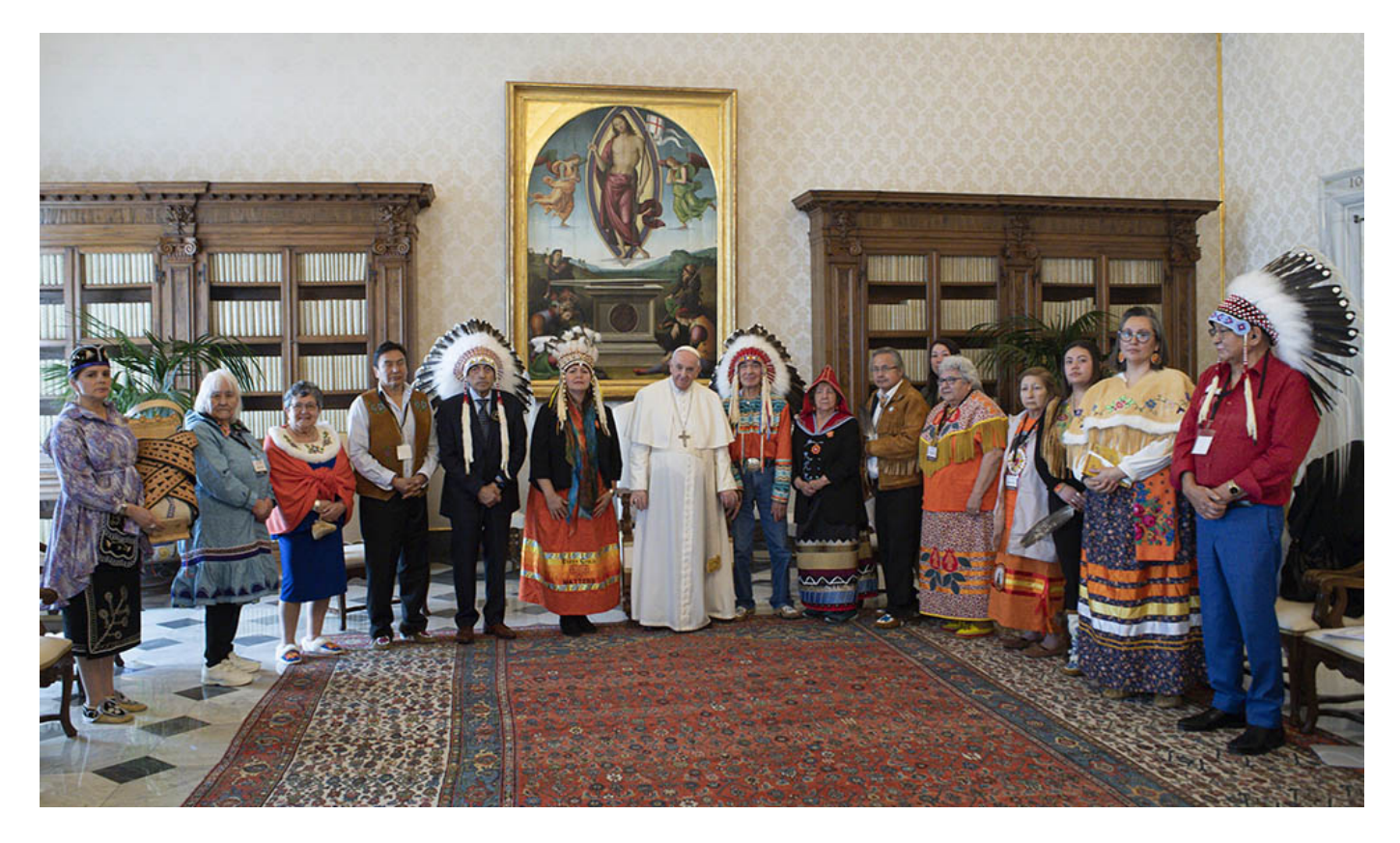
Pope Francis is pictured with Indigenous delegates from Canada's First Nations during a meeting at the Vatican March 31.

Francis can push this further and affirm that the church, despite contradiction and complicity, has always been Indigenous. The true church in Turtle Island, an Indigenous name for North America, is not that of the residential schools but of the often ignored, even persecuted anti-colonial church that grew among Indigenous peoples from the very beginning.