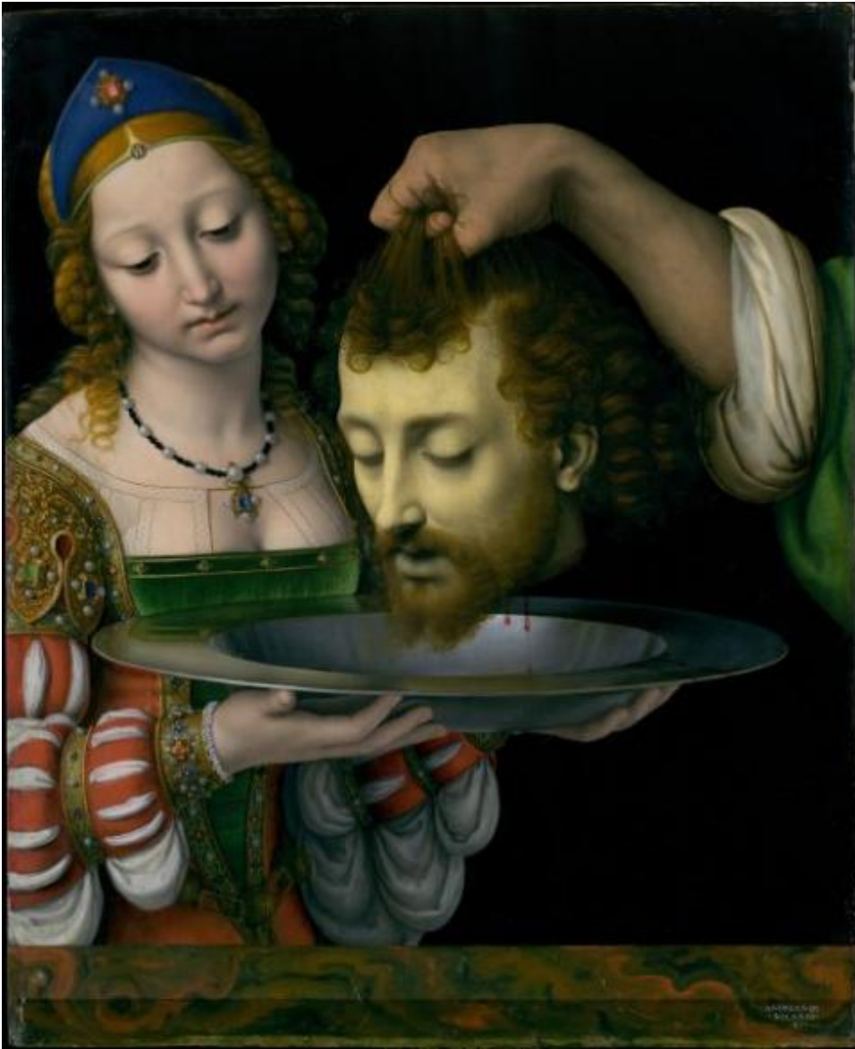
Salome with the Head of Saint John the Baptist by Andrea Solario