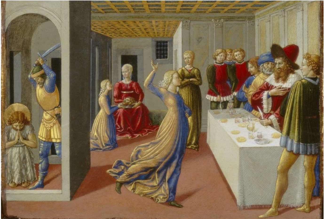
"The Feast of Herod and the Beheading of Saint John the Baptist" (ca. 1461) by Benozzo Gozzoli