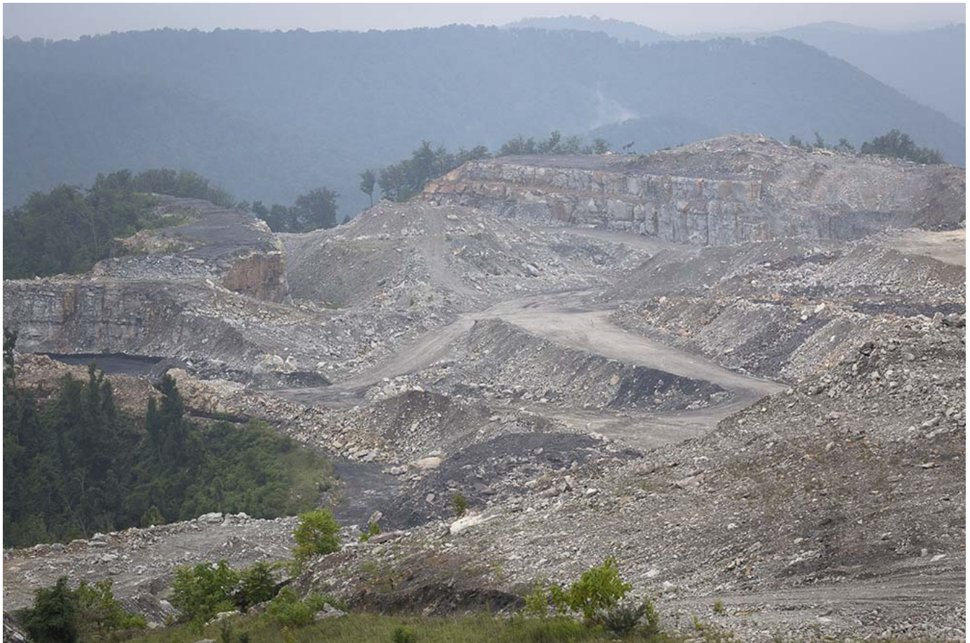
A mountaintop-removal coal mine on Kayford Mountain south of Charleston, West Virginia, is seen in 2014.

"Congress is not always able to pass a law the instant that we learn something new about a virus or about a pollutant, or about, you know, machinery that fails on the workplace. ... Since almost the beginning of the republic, the whole idea behind having agencies is that we give them directives, and that they act in ways that are flexible, and smart, and based on expertise to protect people," he said.