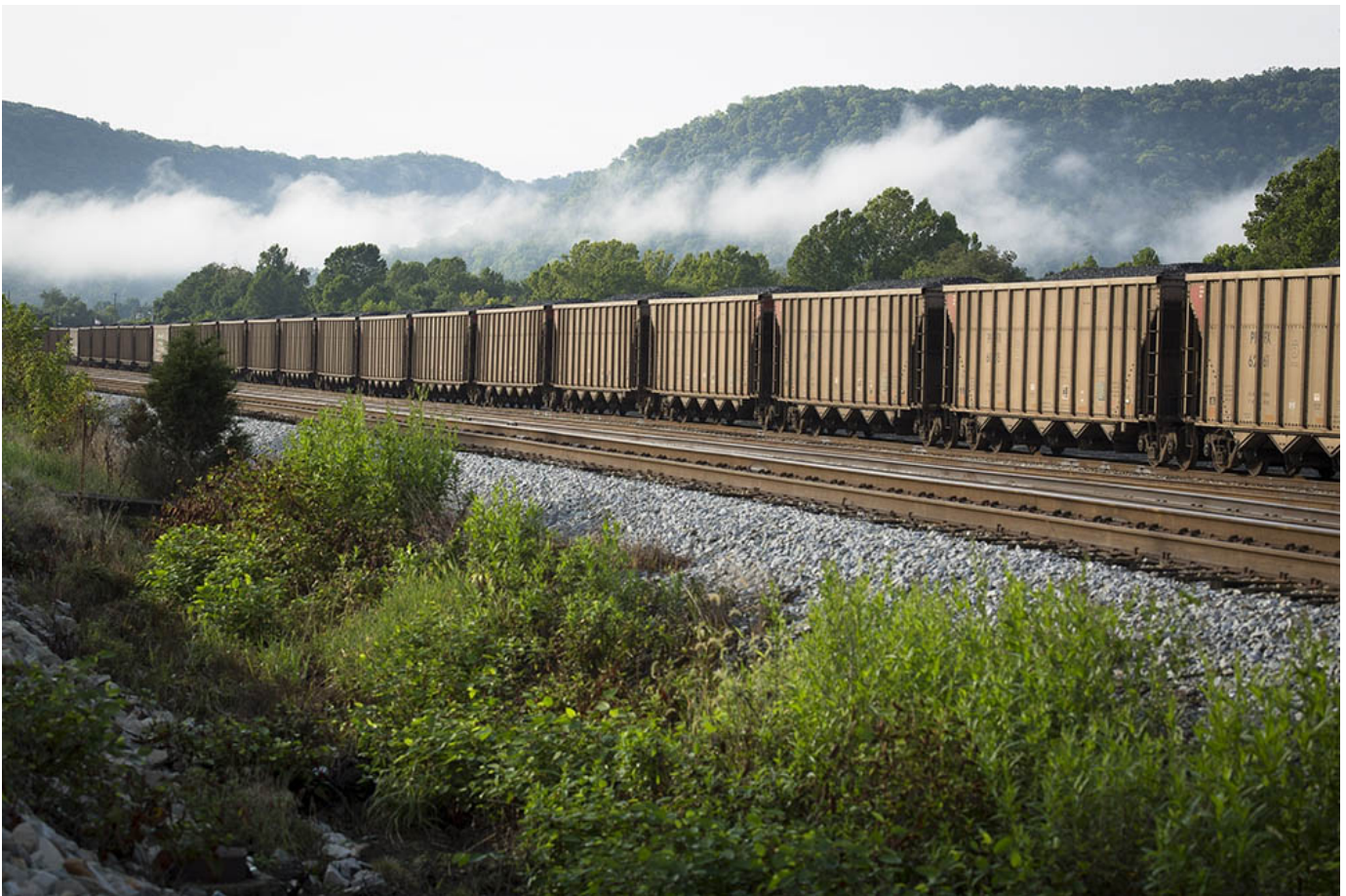
A train carries coal near Ravenna, Kentucky, in 2014.

"Make no mistake, the Supreme Court's ruling today risks the lives of thousands of people by limiting the ability of the U.S. government to regulate carbon pollution from power plants. It prioritizes polluters, especially the coal industry, over people," she said in a statement.