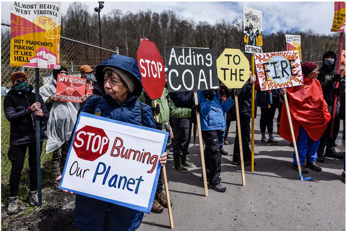
People in Grant Town, West Virginia, protest the Grant Town Coal Waste Power Plant April 9.

more dangerous heat waves, flooding, droughts and extreme storms.