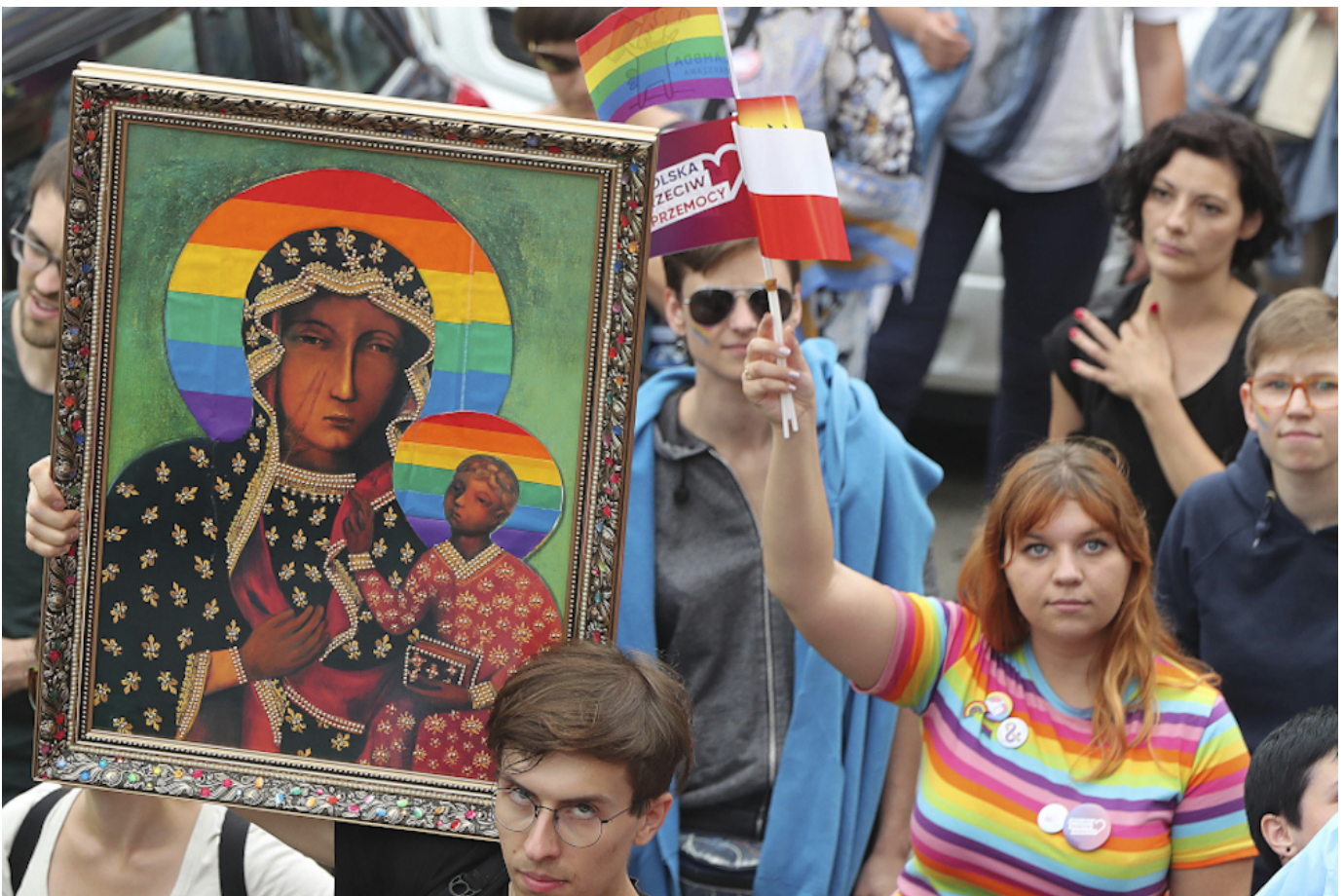
LGBTQ activists and supporters gather for the first-ever pride parade in the central city of Plock, Poland, on Aug. 10, 2019.

"In all honesty, if you had told us as young boys who wasted countless hours of our lives in church trying to 'pray the gay away' that we someday would be standing in front of all of you in our Catholic Church talking about our family on Father's Day, we would never have believed you," they said in their reflection.