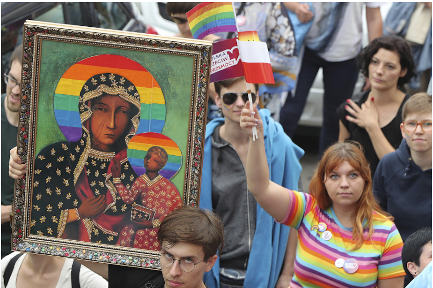
LGBTQ activists and supporters gather for the first-ever pride parade in the central city of Plock, Poland, on Aug. 10, 2019.

"In all honesty, if you had told us as young boys who wasted countless hours of our lives in church trying to 'pray the gay away' that we someday would be standing in front of all of you in our Catholic Church talking about our family on Father's Day, we would never have believed you," they said in their reflection.