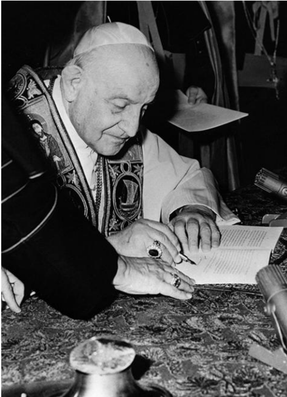
Pope John XXIII signs his encyclical "Peace on Earth" ("Pacem in Terris") at the Vatican in this 1963 file photo.