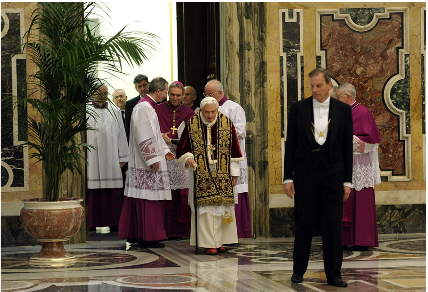
Pope Benedict XVI walks with a cane as he arrives for a meeting of cardinals at which he read his resignation in this Feb. 11, 2013, file photo from the Vatican. There were no media members in attendance.