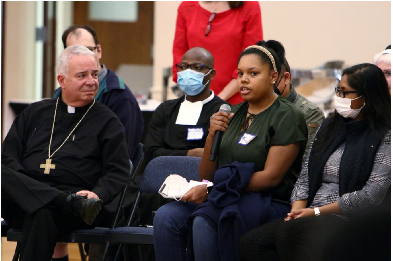
Philadelphia Archbishop Nelson Pérez joins college students, other young adults and ministry leaders during a synodal listening session at La Salle University April 4.